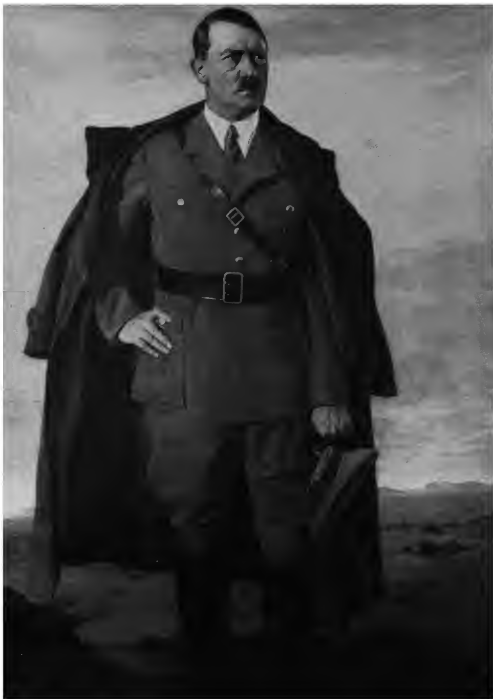
Adolf Hitler, unser Führer