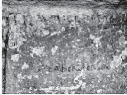
Συναγωγή Μαρκιωνιστών κωμ(ης) Λεβαβών του κ(υρίου) και σω(τη)ρ(ος) Ιη(σου) Χρη(στο)ύ προνοια(ι) Παύλου πρεσβ(υτέρου) -- του λχ' ετους.

The plaque is dated 318 A.D. and reads "The Lord and Saviour Jesus, the Good" and is the earliest mention of Jesus in recorded history (Le Bas and Waddington, Inscriptions , No. 2558, vol. iii. p. 583) and more ancient than any dated inscription belonging to a Catholic church.