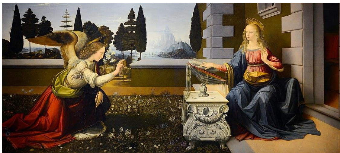
The Annunciation (in Italian, Annunciazione ) is one of the most famous paintings by the Italian Renaissance painter Leonardo da Vinci . It is painted in oil on panel (poplar wood) measuring 98 cm high and 217 cm wide and dates from the period 1472-1475. It is kept in the Uffizi Gallery in Florence.

The above is merely an intellectual construct with no basis in AT, and I will explain why.