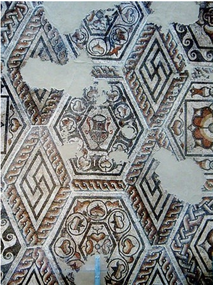
340px-Silchester_mosaic.jpg (128.67 KiB) Viewed 343 times