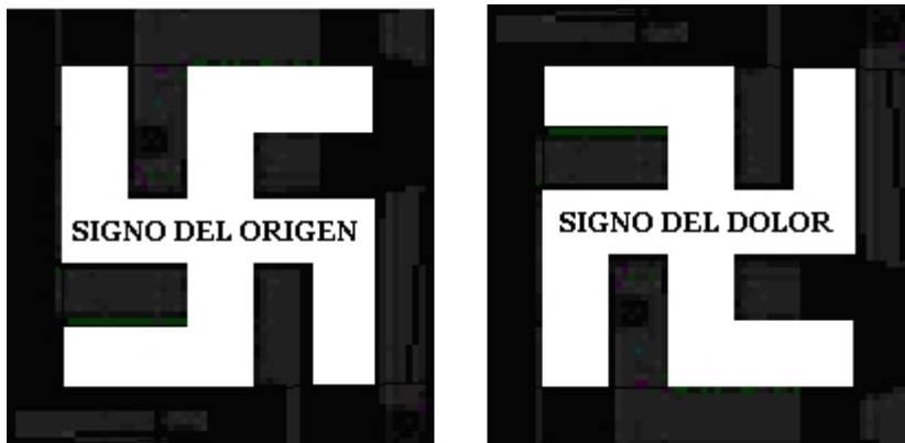
THE LEFT-TURNING SWASTIKA AND THE ARCHETYPICAL RIGHT-TURNING SWASTIKA.png (7.15 KiB) Viewed 115 times

The search for, selection and choice of an esoteric or religious truth culminates in the synarchic initiations of Freemasonry or the Lodges of the Universal White Brotherhood. Here we will simply make a clarification: all Eastern esotericism and its religions are under the highest hierarchy of Chang Shambala, and the sacred symbol of the Universal Synarchy of Chang Shambala is the ARCHETYPICAL DEXTEROUS SWASTIKA . From its mutilation comes the KALACHAKRA TEMPLE CROSS , representative of the SIGN OF PAIN/LOVE . For this reason, there is an antagonism between the CROSS and the STAR OF DAVID , which is the sacred symbol of the people chosen by the Demiurge, his representative in the world. This is because the TRAITOROUS SIDDHAS OF CHANG SHAMBALA have a PLAN different from the PLAN of the DEMIURGE AND HIS CHOSEN RACE, THE HEBREW RACE , and these differences between the ONE and the rulers of the OUTER LABYRINTH KALACHAKRA are the cause of DISPUTES and WARS between them. CHRISTIANITY and JUDAISM are topics we explore in depth in the text ARGENTINA AND THE END OF HISTORY , leaving aside this "history," to which we will return when we describe the WAR between the RUNIC LABYRINTH OF THE VIRYA BERSERKR (INNER WORLD) and the OUTER LABYRINTH KALACHAKRA (OUTER WORLD) .