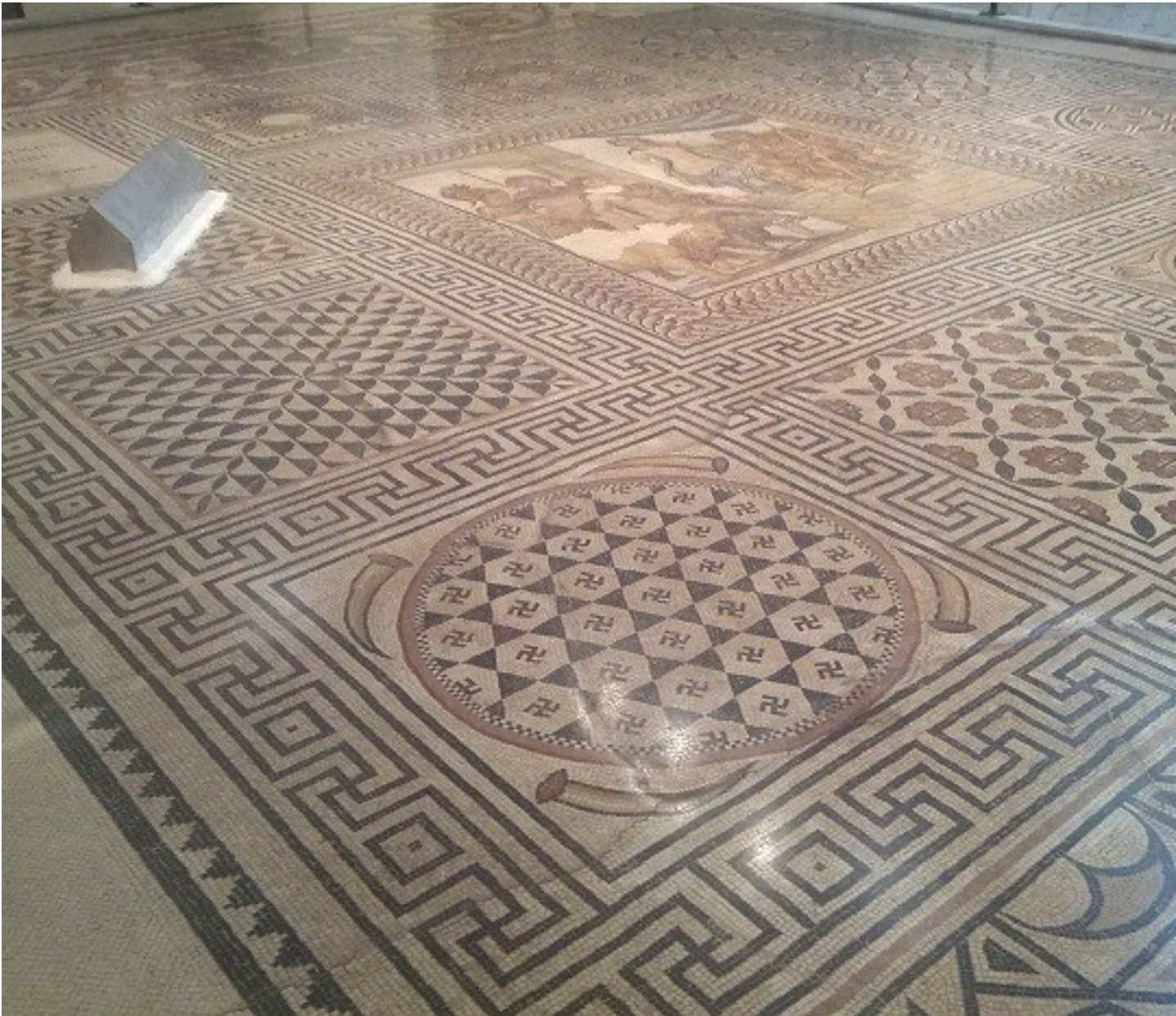
europa_france_nîmes_roman_mosaic_2.jpg (169.52 KiB) Viewed 343 times