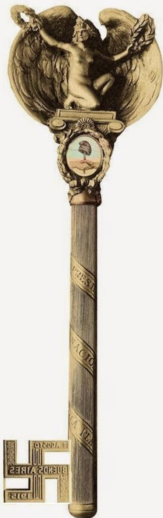
Retiro station key - 1915.jpg (78.43 KiB) Viewed 30 times