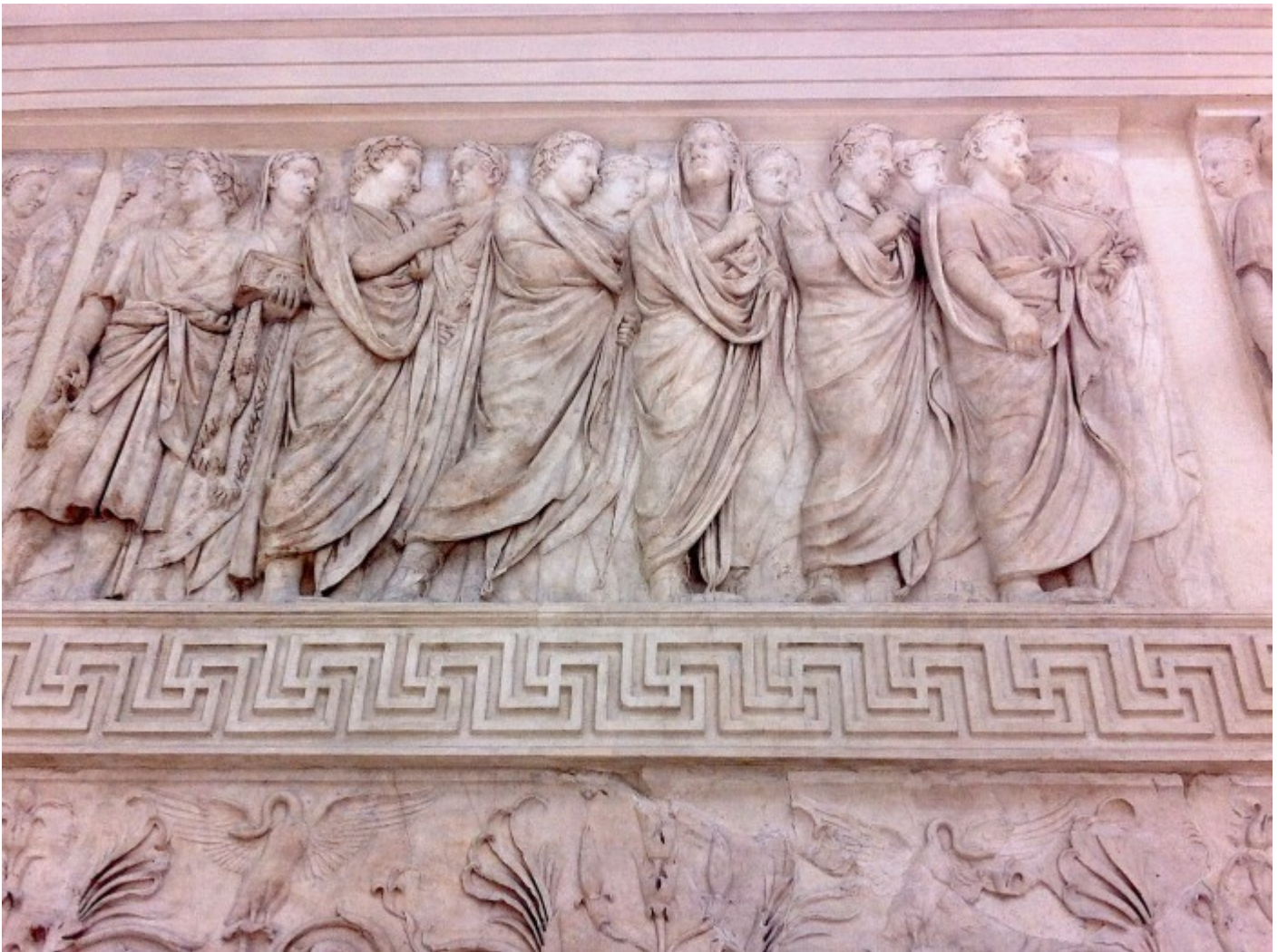
photos-of-rome-arapacis-losviajesdecarol6-700x523.jpg (134.35 KiB) Viewed 343 times