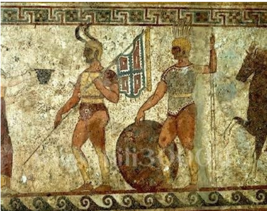
10896931_930104637000657_8970671237714194529_n.jpg (84.19 KiB) Viewed 343 times