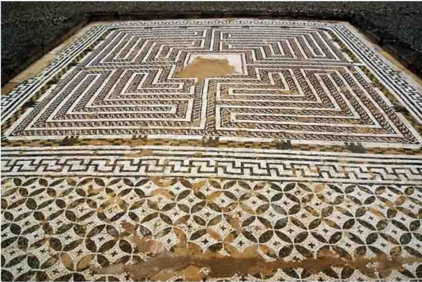
captura_4.jpg (135.85 KiB) Viewed 343 times