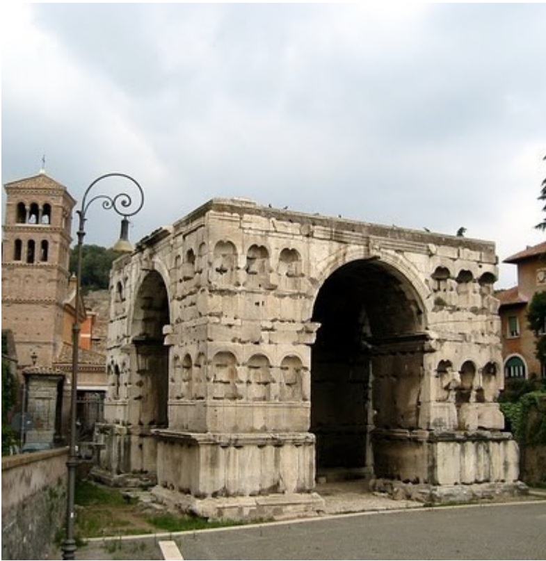
arcodejano.jpg (48.38 KiB) Viewed 85 times

BACK IN THE "INNER LABYRINTH" (INNER WORLD) TO THE SELBST AND THE VRIL.