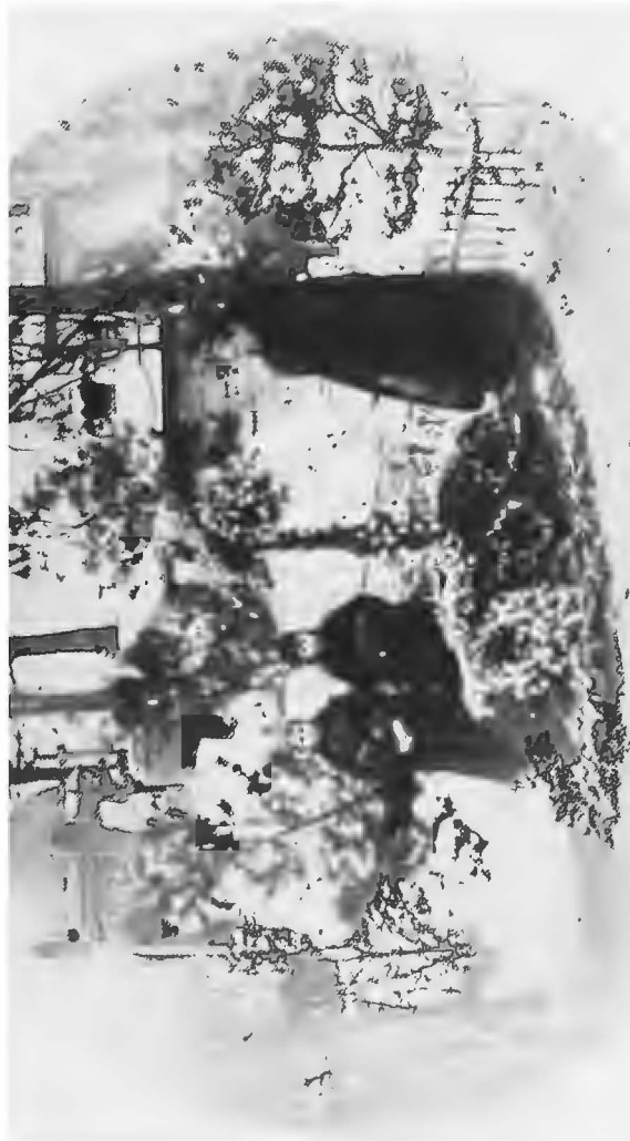
THE WIDOW AND CHILDREN OF DOSTOEVSKY AT HIS GRAVE IN PETERSBURG.