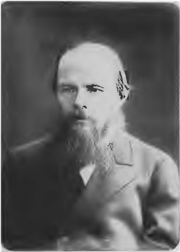
DOSTOEVSKY, PETERSBURG, 1879.