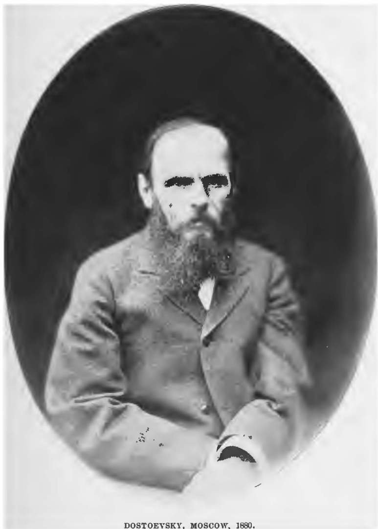
DOSTOEVSKY, MOSCOW, 1880.