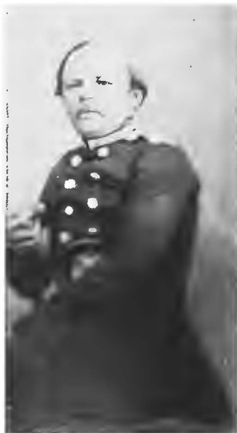
DOSTOEVSKY AT SEMIPALATINSK (1858), IN ENSIGN'S UNIFORM.