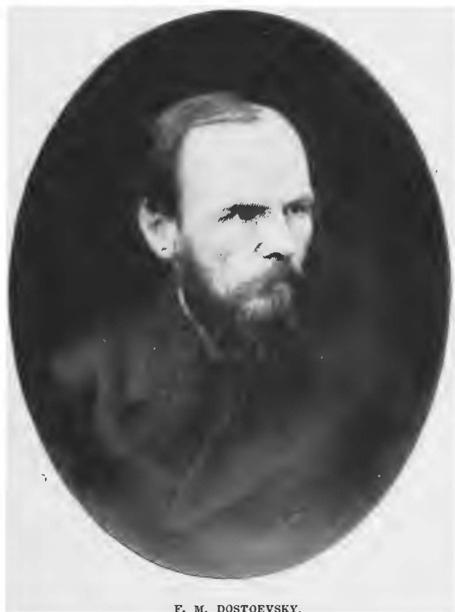
F. M. DOSTOEVSKY.