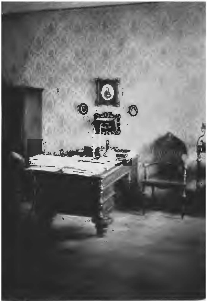
DOSTOEVSKY'S STUDY IN PETERSBURG.