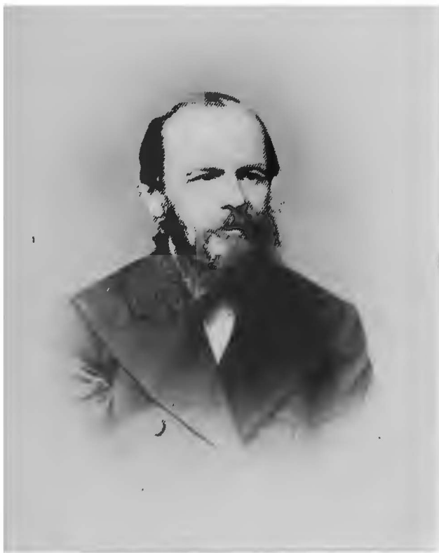
DOSTOEVSKY, PETERSBURG, 1876.