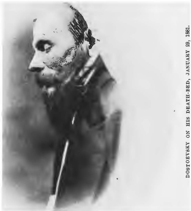
DOSTOEVSKY ON HIS DEATH-BED, JANUARY 29, 1881.