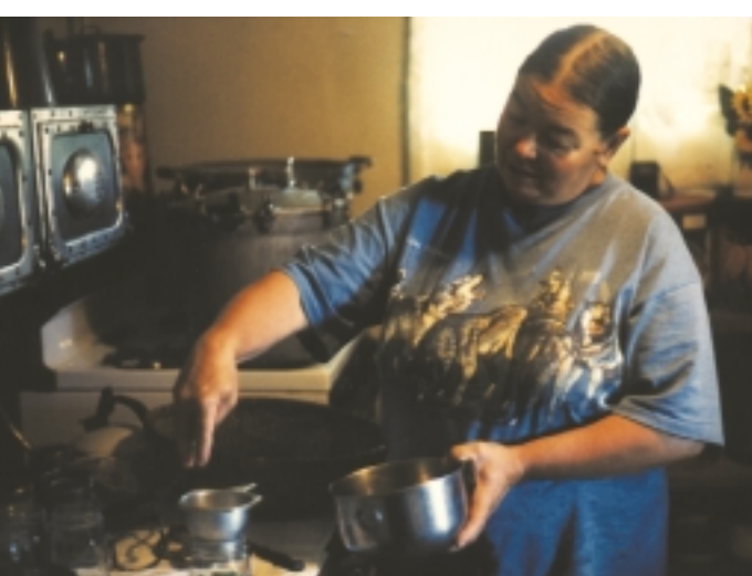
The author packs cold asparagus into clean jars.