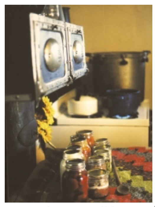
Two days' canning yields beets, elk meat, green beans, potatoes, chili, and corn.

large expense for many frugal folks, costing about $125 for the larger, more work-worthy size. But, when you figure it will last for over 20 years, without maintenance, it is one of the best buys of a lifetime. Remember, you can use it to put up nearly anything that you would see on a store shelf or that you may hunt or fish for yourself.