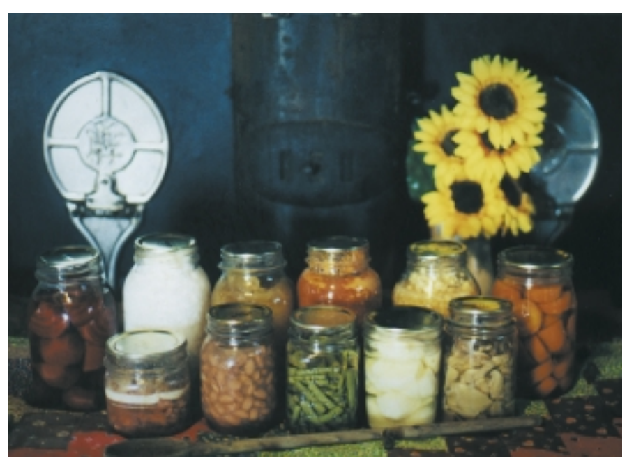
A variety of foods canned in the pressure canner: left to right: beets, hominy, squash. chili, corn, carrots, elk meat, baked beans, asparagus, potatoes, and wild mushrooms.

Cut-up or whole green beans, potatoes, corn, other vegetables or meat, poultry, and fish may be placed in