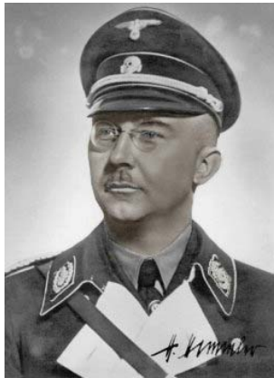
Reichsführer Heinrich Himmler 1900-1945 Satanic Coven Grand Master Dedicated Disciple of Satan

This text is dedicated in loving memory to