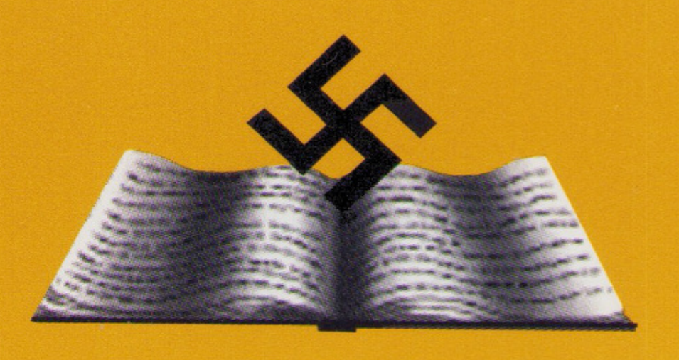
as selected & compiled by the NEW ORDER