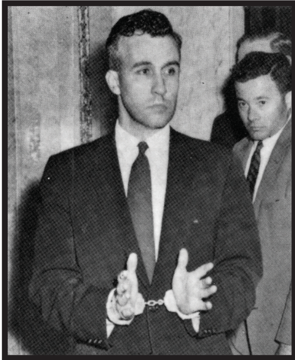
Francis Parker Yockey (1917-1960) on his way to the prison in which he would be found dead, reportedly a suicide.