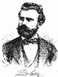
Győző Istóczy (1842-1915.)

A pseudo-Hungarian culture with a Jewish flavour and Jewish colour is flourishing here in such a dense, impenetrable culture that the true Hungarian spirituality, pure and simple, is slowly taking on a secondary role. This was more or less the situation in Hungary in the 1980s, when the first representative of Hungarian political anti-Semitism and Hungarian racial protection launched the struggle for the vital interests of Hungarians.