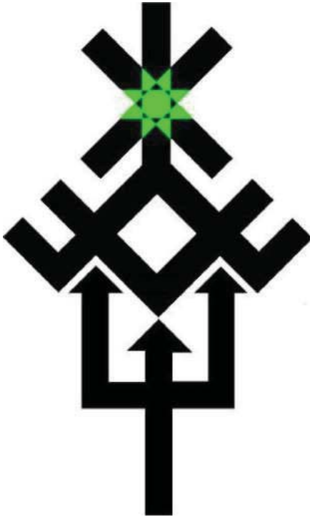
HAGAL + TIRODAL DE LA VICTORIA + GUIBUR