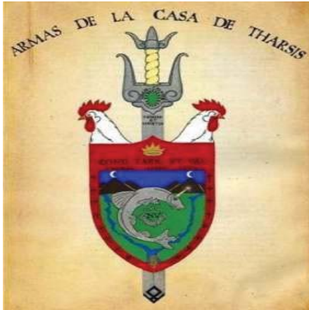
Fragment of the novel, twenty-fourth day:

"The King of Castile and Leon, Ferdinand III the Saint, reconquered Seville in 1248 but died there in 1252; his son, Alfonso X the Wise, completed the campaign by conquering the Algarve and the towns of Niebla and Huelva in 1258. The King gave this region as a dowry to his natural daughter Beatriz, who joined it to the crown of Portugal when she married Alfonso III. As such annexation injured the ancient rights that the House of Tharsis had over the region, the Crown of Portugal compensated the Knight Odielón de Tharsis Valter with the title of "Count of Tarseval". In fact, in the Coat of Arms that Portugal gave to the House of Tharsis, there was inscribed in chief the legend: "Con. Tars. et Val.", with which the title "Count of Tharsis and Valter" was abbreviated; the later direct reading of the legend ended up joining the syllables of the abbreviation and forming that word "Tarseval" that identified the House of Tharsis in the following centuries. The design of that coat of arms was the product of an arduous negotiation between Odielón and the Portuguese Heralds, in which the new Count imposed his point of view by appealing to the difference in language and a whimsical explanation of the requested emblems.