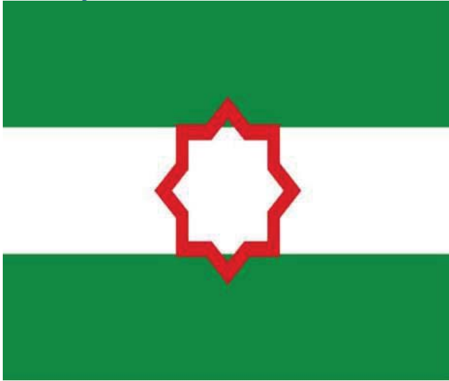
A flag ("Arbonaira"--"Arbondaira"...Ar runa fuego del Origen ...-Bon de .....buenoaira de aire y ario) y

The current coat of arms of the land of Tharsis-Turdetania is of interest to us for its particular Hyperborean symbolism: created by Blas infante at the beginning of the 20th century, with the white Almohad and the two green Umayyad stripes (we consider in them Semitic elements, although the green is the color of the Astro Venus-LIGHT from the origins) shows a hyperborean HERAKLES under a semicircular arch in which it says "Dominator Hercules Fundator", between the two columns of the Strait of Gibraltar (reference point after the Atlantide debacle and the beginning of the pilgrimage of the white peoples through the desert of longing) and two lions, one crouched in a waiting position and the other with its left paw raised (left path, mudra bullet) and almost ramping... Lions have always been symbols of the magnanimous authority of the lineages of .....kings. reads "Andalucía por sí para España y la Humanidad" (in which we also observe a clear contaminating Humanist element).