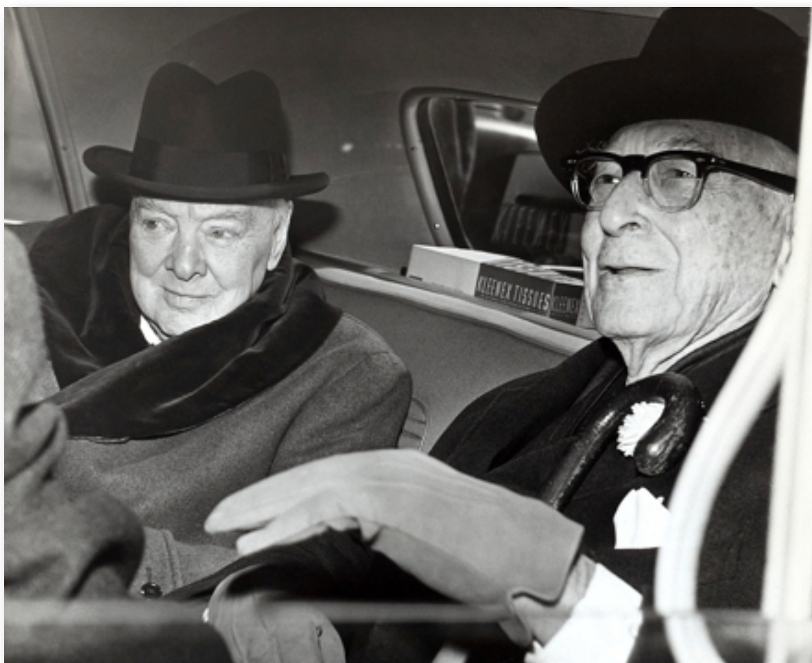
[Image] Winston Churchill and Bernard Baruch , financier, converse in the back seat of a car in front of Baruch's home.

Behind the secret of the atom sits enthroned one of the most mysterious and powerful personalities of world Jewry in the person of Bernard Baruch, “ the philanthropist ” banker who, in the most obscure circumstances amassed a personal fortune during the two world wars. In the imagination of the American people, perhaps not without reason, Bernard Baruch appears as the “ unofficial President of the U.S. ” and even Churchill has to visit Baruch first, before he calls at Washington to see the official President of the US. When Roosevelt became President, Baruch’s power and influence was multiplied.