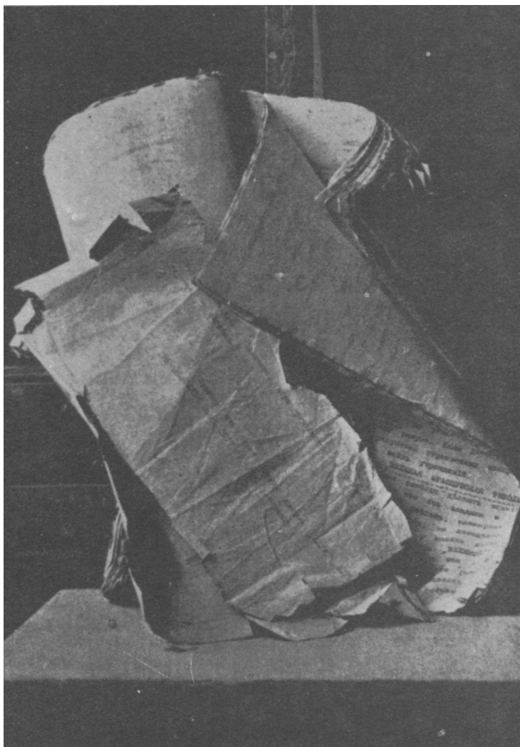
A type-written copy of the Protocols on rice paper circulated in Siberia. It was taken from the 4th edition (1917) of Nilus. There are a number of interesting notes by an unknown editor. Taken to America from Vladivostok in August 1919.