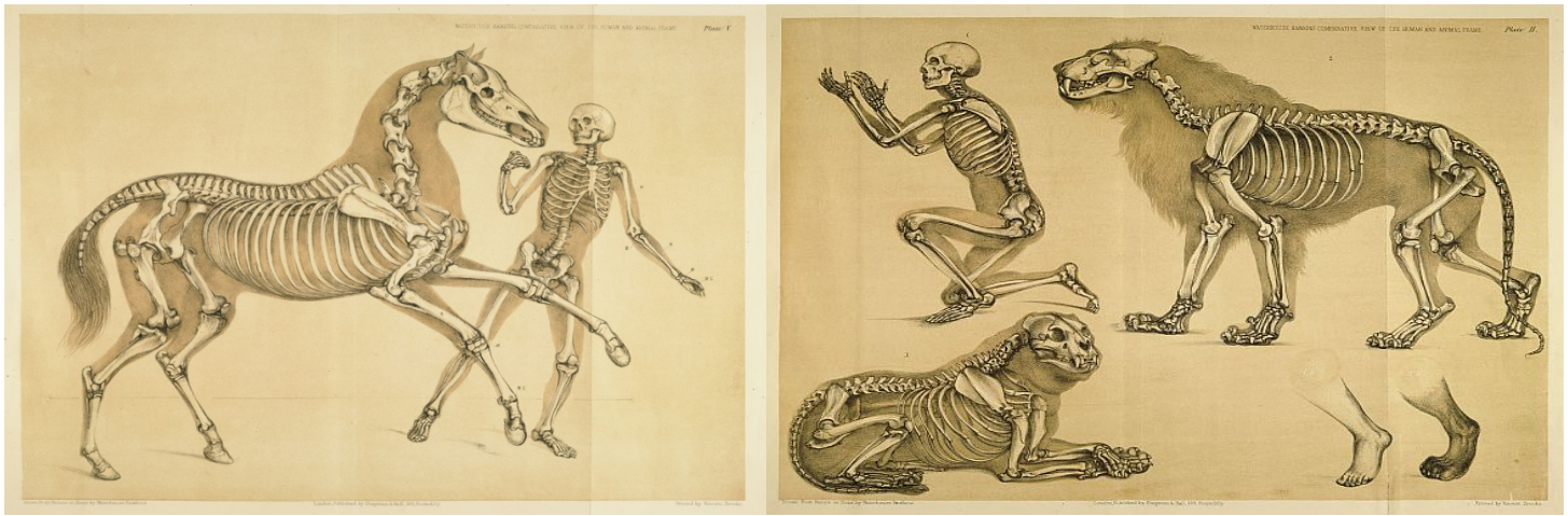
In no particular does man resemble either the carnivora, herbivora or omnivora

It may be mentioned, in connection with the chart, that the classification of man's diet and urine appear to have been made in accordance with his structure and physiology rather than from what one might observe in the world of civilized man. It is well known that man is not presently living upon fruits and nuts and that his urine is not alkaline, but since man's structure and physiology imply the use of frugivorous diet, and since such a diet produces an alkaline urine, the classifications were apparently made with those thoughts in mind.