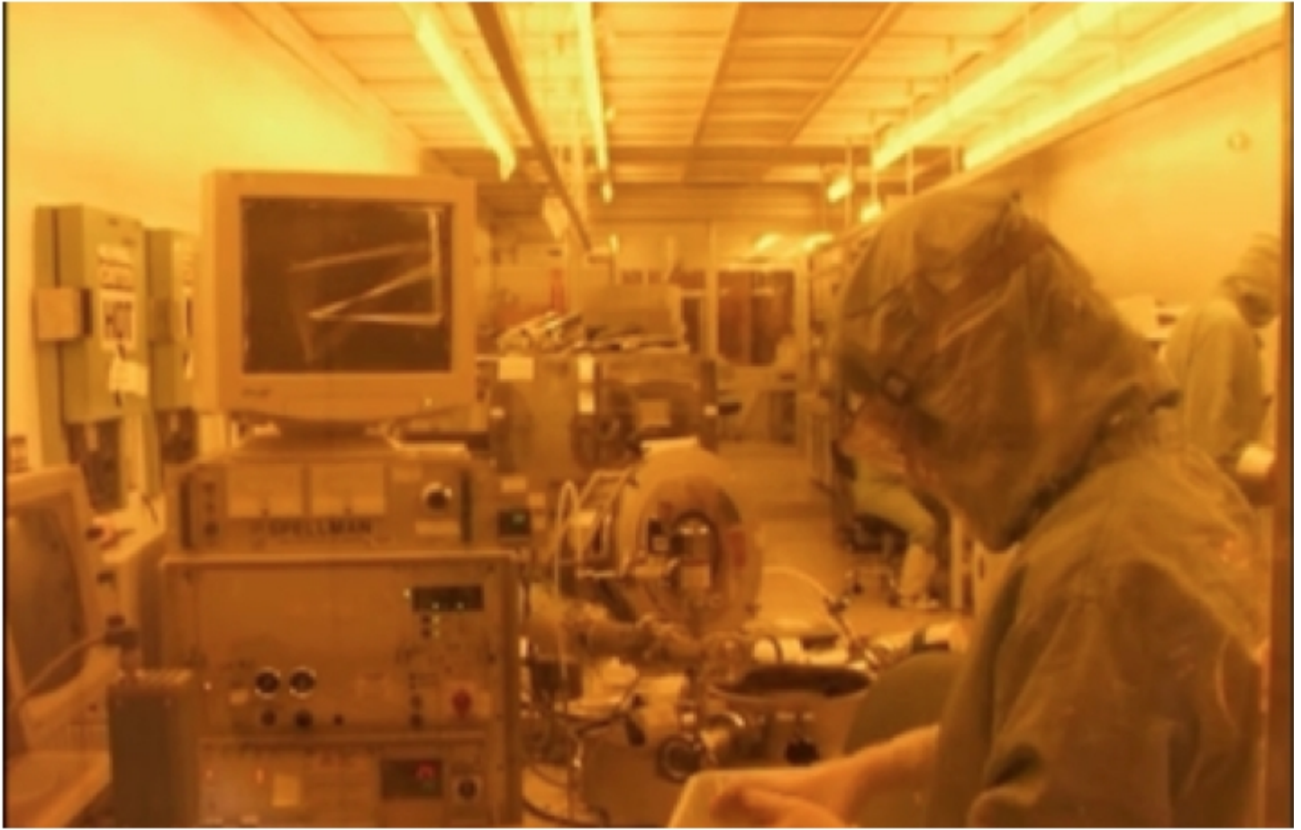
This is the new “mom” in her technocratic place of employment