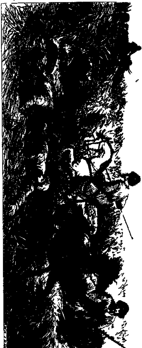
INTENDING UPON THE HAUNTS OF THE WILD BOAR