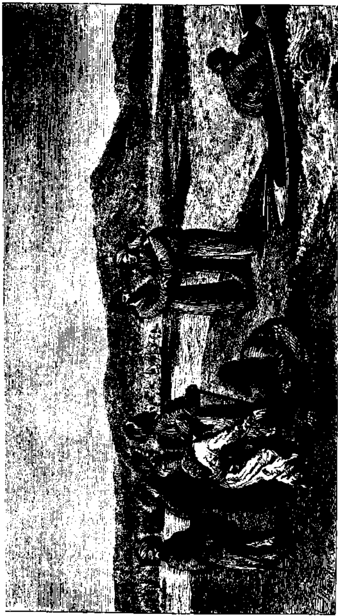
RECEPTION BY TURKOMAN CHIEF ON THE CASPIAN SHORE.