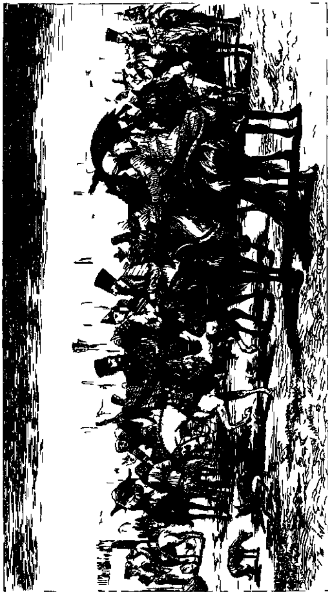
MARKET ON HORSEBACK—AMONGST THE CABBAGES