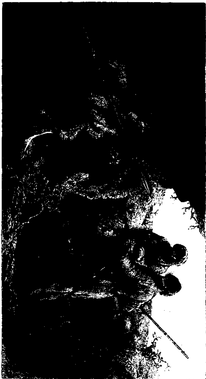
WILD MAN IN THE DESERT.