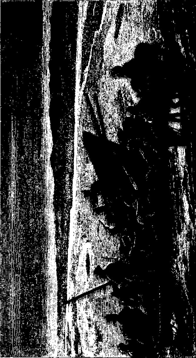
THE FERRY ACROSS THE OXUS.