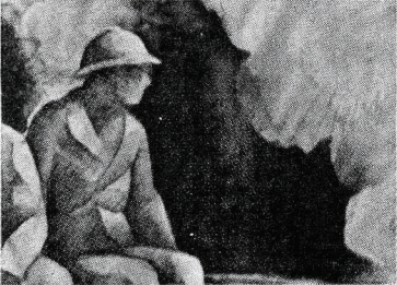
Tiger Shoot P. 106