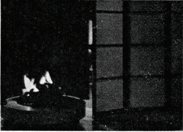
Playboy Pad P. 119