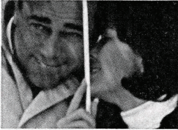
Fashion Forecast P. 89