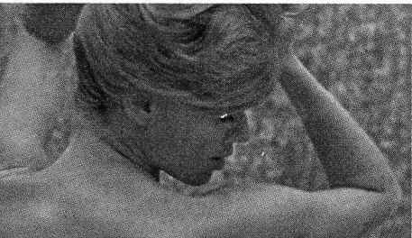
Cover Story P. 128