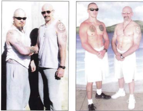
With friends in prison.