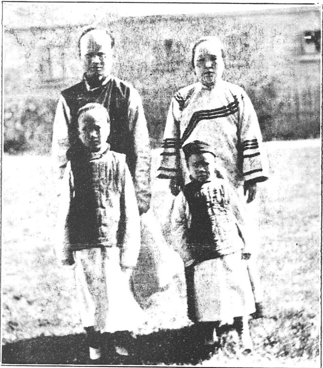
A Chino-Jewish Family.