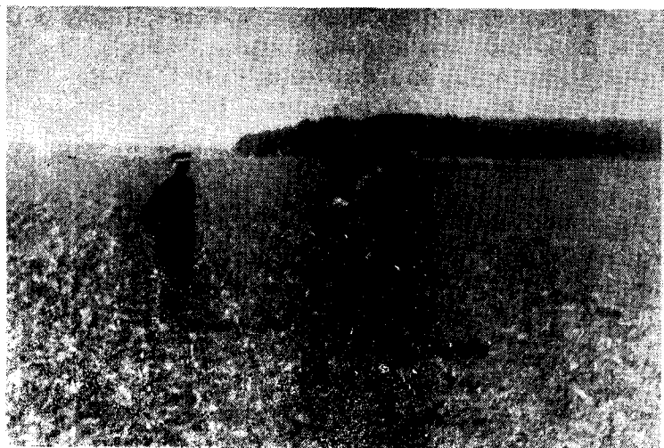
Russian agronomist (on left) and the author.

The results in increased india rubber production were quite satisfactory. One of our superiors went to Russia, and returned with a number of scientists. They came with their families and worked for us as civilians, enjoying their work.