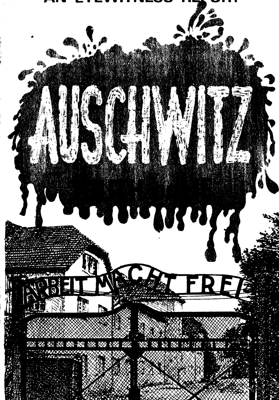
Das Tor zum Konzentrationslager in Auschwitz

Order from: LIBERTY BELL PUBLICATIONS Reedy, West Virginia 25270