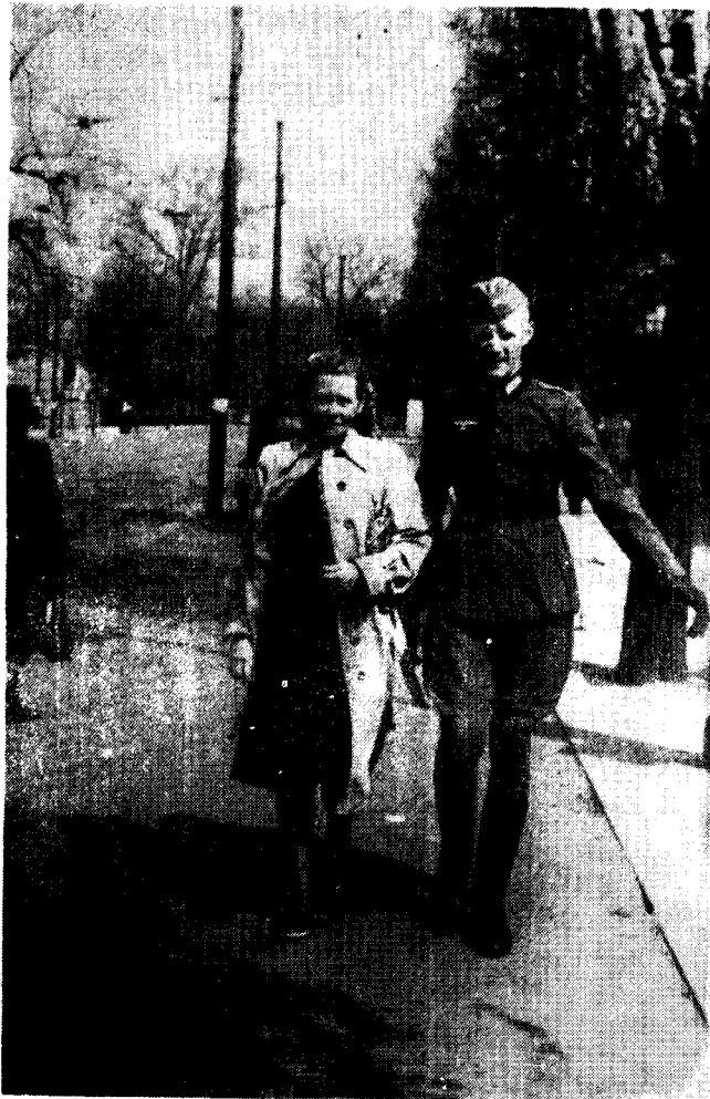
Author and wife on leave in the East. 1944.

"Kanada" was kept under guard at all times to prevent looting from the outside. In our weather station we had a female SS-worker who, on one occasion, "organized" a pair of stockings for herself from "Kanada". She was court-martialled for "plundering". However, the inmates themselves, who worked there, stole constantly.