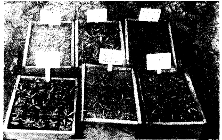
Kok-Sagis plants in various stages of development.

I had been commissioned to pick 100 workers for hoeing the Kok-Sagis plants. At roll call the inmates were asked if they were interested in this kind of work and if they had done it before. Then followed the "selection" of the workers. This "selection" was later completely misinterpreted. The purpose was to give the inmates something to do and they themselves wanted to be occupied. Selecting them meant