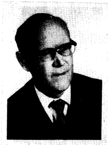
Author as he looks today.