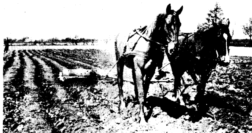
Inmate working in fields (almost hidden by horses). Note only one single guard at great distance, in far left of photograph.

But Detachment 11 also had a secret supply source. The most wonderful things were found by them in unknown hiding places. In the night these were replenished by friends of the inmates. Sometimes these friends even donned inmate attire and marched into the camp, allowing an inmate to take a few days off. Auschwitz was located in Poland and the population helped the inmates as much as possible, though this was officially not permitted.