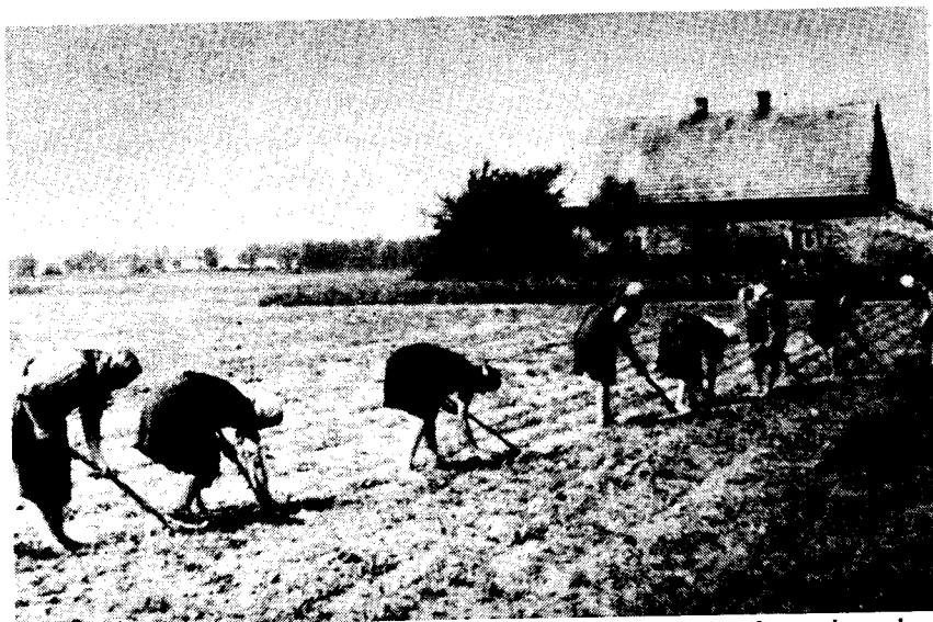
Women inmates working Kok-Sagis fields. Note absence of guards and standard attire of women.

The fact was, however, that in Auschwitz there were more people than were jobs. Naturally, I was concerned with getting workers who had experience on farms. Jews, of course, were not experienced for any kind of farm work, whilst on the other had, Poles were excellent farm workers. Gypsies were entirely useless. Detachment 11 — that was the name of our female workers from Birkenau — came every day to work in the fields that lay beyond the outer line of posted guards. I dealt with these people almost daily and listened to their complaints. On one occasion I saw an SS-guard kick a woman. I confronted him about this. He claimed