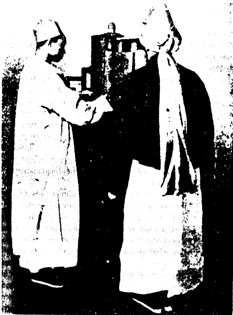
CHINESE JEWS AT THE CEREMONY OF READING THE TORAH