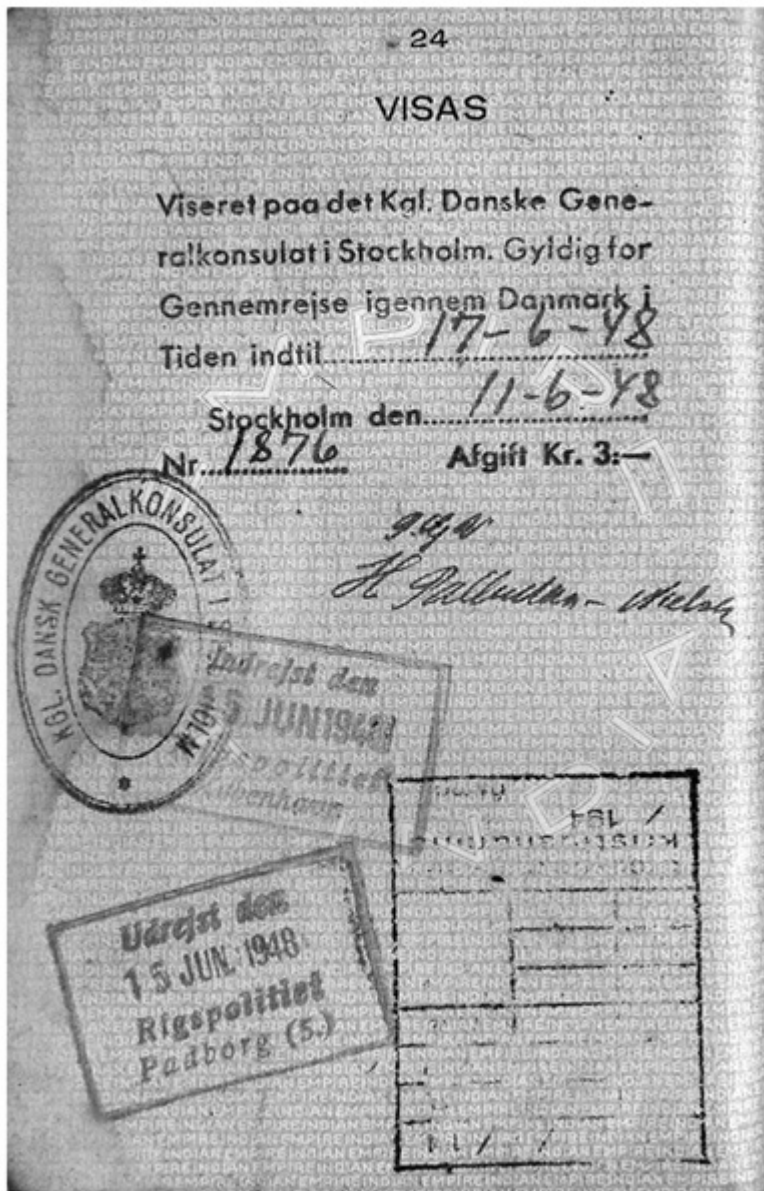
Savitri's visa to pass through Denmark, on "The Unforgettable Night" of 15-16 June 1948.