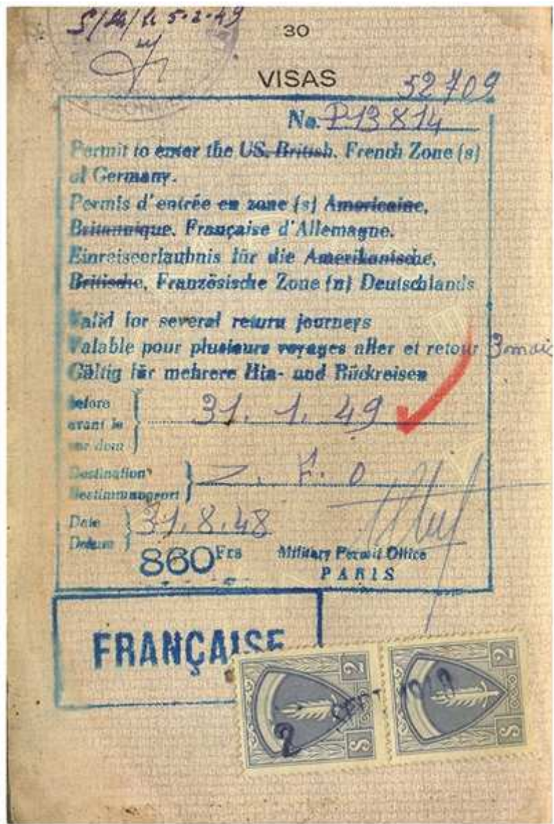
Savitri's military permit to enter French-occupied Germany, issued 31 August 1948