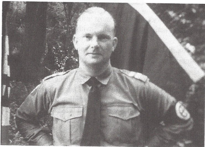
Colin Jordan in the uniform of the National Socialist Movement, 1962.

Born 1923. Education leading to the study of history at Cambridge University, 1946-49, there graduating with an Honours Degree. Subsequently a representative for the north of Scotland for a major firm, and then a teacher until banned from teaching because of out-of-school activities. Active in a succession of political organisations between 1946 and 1962, in which latter year founded and led the National Socialist Movement. Imprisoned in 1962 for organizing an elite formation in that Movement and for a "Hitler Was Right!" speech in London's Trafalgar Square. Again imprisoned in 1967 for literature on the issues of Jews and Coloured immigration. Headed the British Movement, which replaced the N.S.M. in 1968, till withdrawal from it in 1975 because of personal commitments. Since then has confined himself to writing and to literature sales.