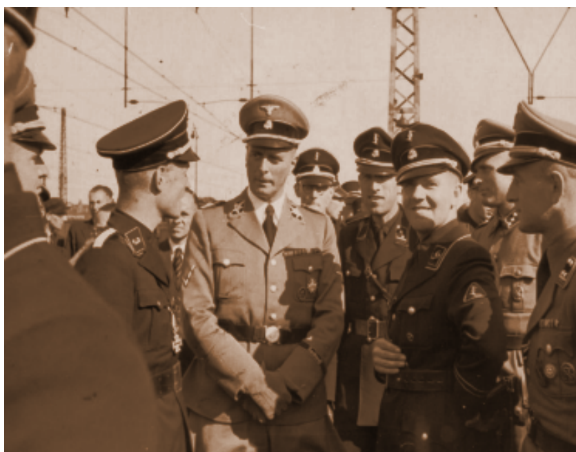
Henk Feldmeijer, leader of the Dutch SS, posing next to SS-Brigadeführer Hanns Albin Rauter, the highest ranking SS-officer in the Netherlands.

In the years leading up to the Second World War Feldmeijer grew close with German SS-officials. This led to him receiving the order, in September 1940, from Hanns Albin Rauter to form the Dutch SS. After the start of the inevitable war with Stalin's Bolshevik empire, many Dutch SS-Männer followed Feldmeijer's example and joined the Waffen SS. Feldmeijer served in the famous Leibstandarte Adolf Hitler and SS Division Wiking. After his return from the battlefield Feldmeijer led the Sonderkommando-Feldmeijer, successfully routing out the Dutch resistance. Feldmeijer died on the 22nd of February 1945 when his car was strafed by an allied aeroplane. True to his character to the last, Feldmeijer was on his way to the front. Himmler sent Rauter a telegram when he heard the news: I am very sad over the death of Feldmeijer. Feldmeijer was the future of Holland in my eyes.