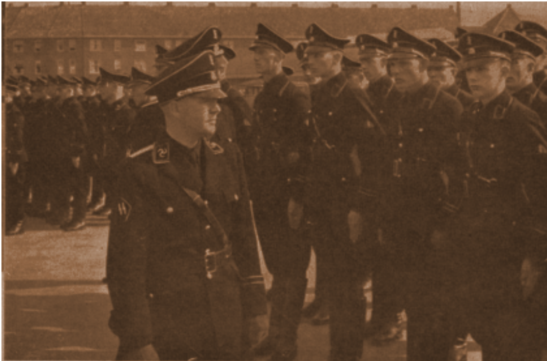
Feldmeijer inspecting his SS troops before a parade in Amsterdam, The Netherlands.