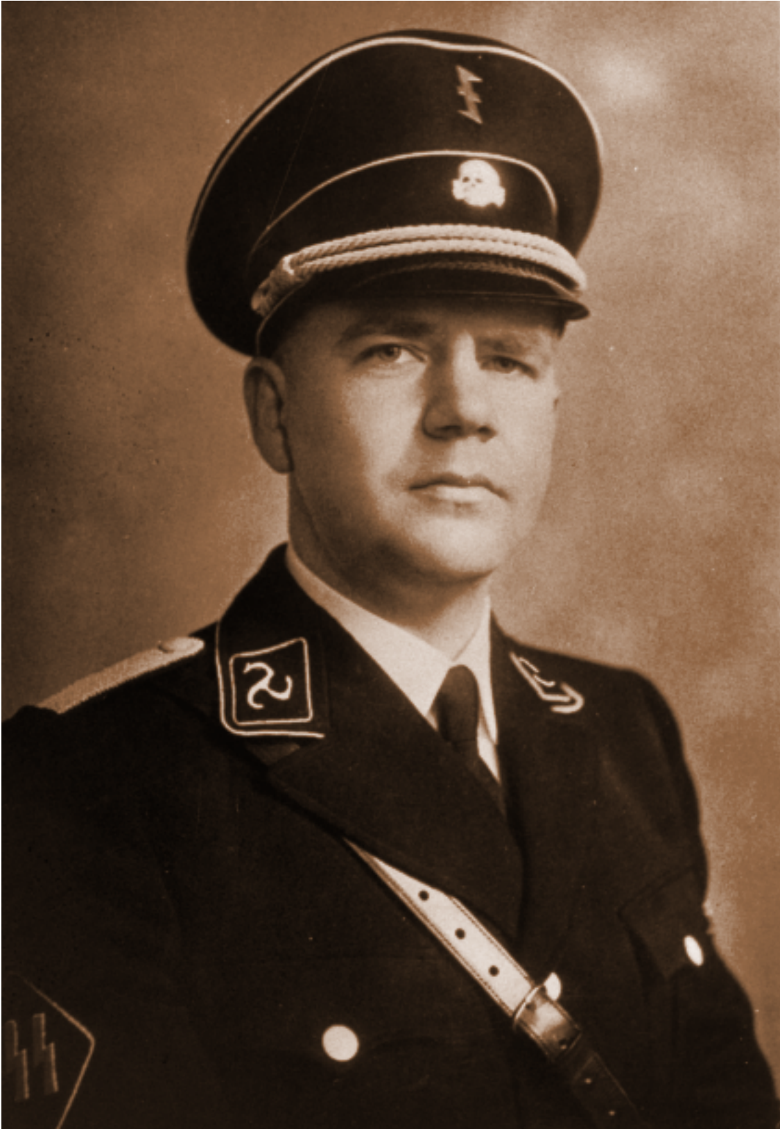
Johannes Hendrik Feldmeijer (1910-1945)