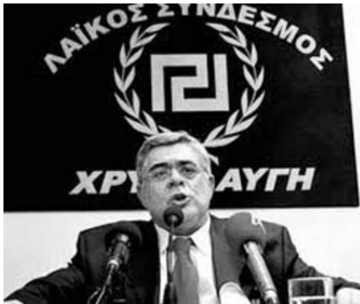
[Above: Nikolaos Michaloliakos, leader of Greece's third largest political party the Golden Dawn.]

These “what if” questions are impossible to answer with any degree of certainty, though I will offer my thoughts given what I know about Germany’s ‘last days’ circumstances. Thus we will encounter a lot of speculation in my answer.