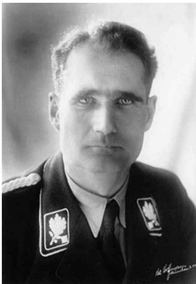
[Above: Rudolf Hess]

I'm curious to hear your thoughts on Rudolf Hess... 46 years of imprisonment. The evidence is overwhelming that he was murdered. What did the Allies think he knew that they were so worried about him revealing? There are records on Hess in Britain that are sealed until 2017! Any theories on why all the secrecy?