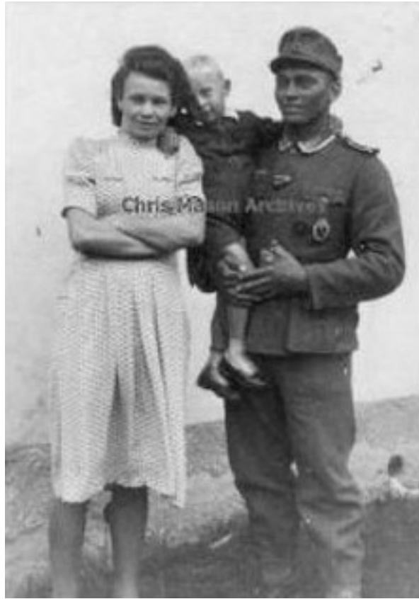
[Above: An example of a non-white volunteer (and family). ]