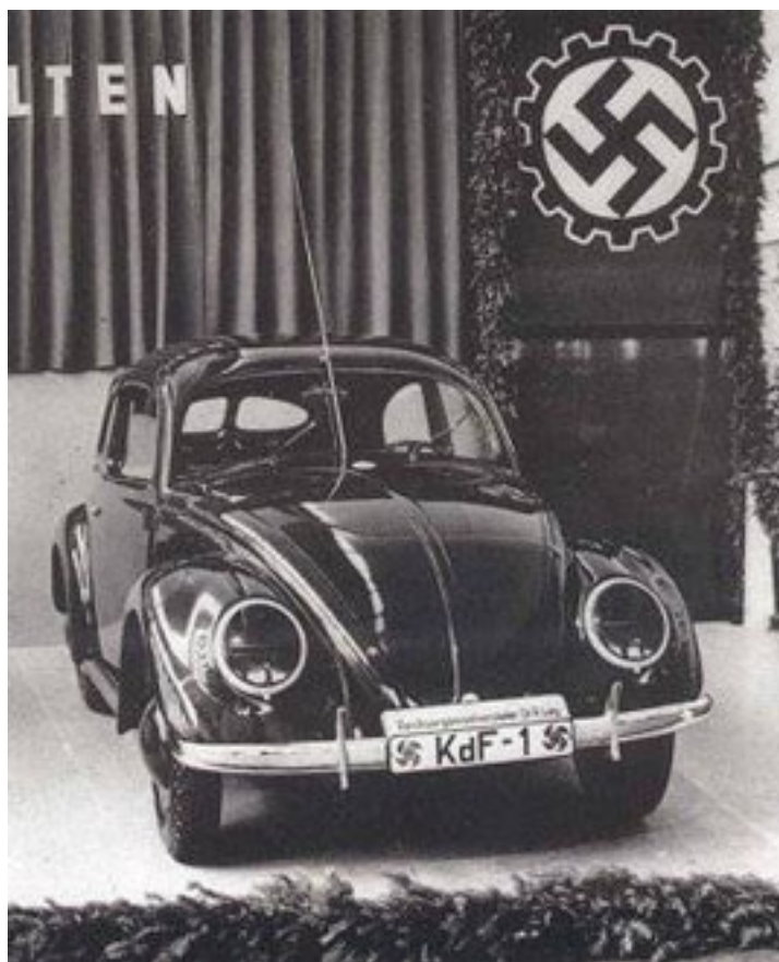
[Above: The Volkswagon, or People's Car.]