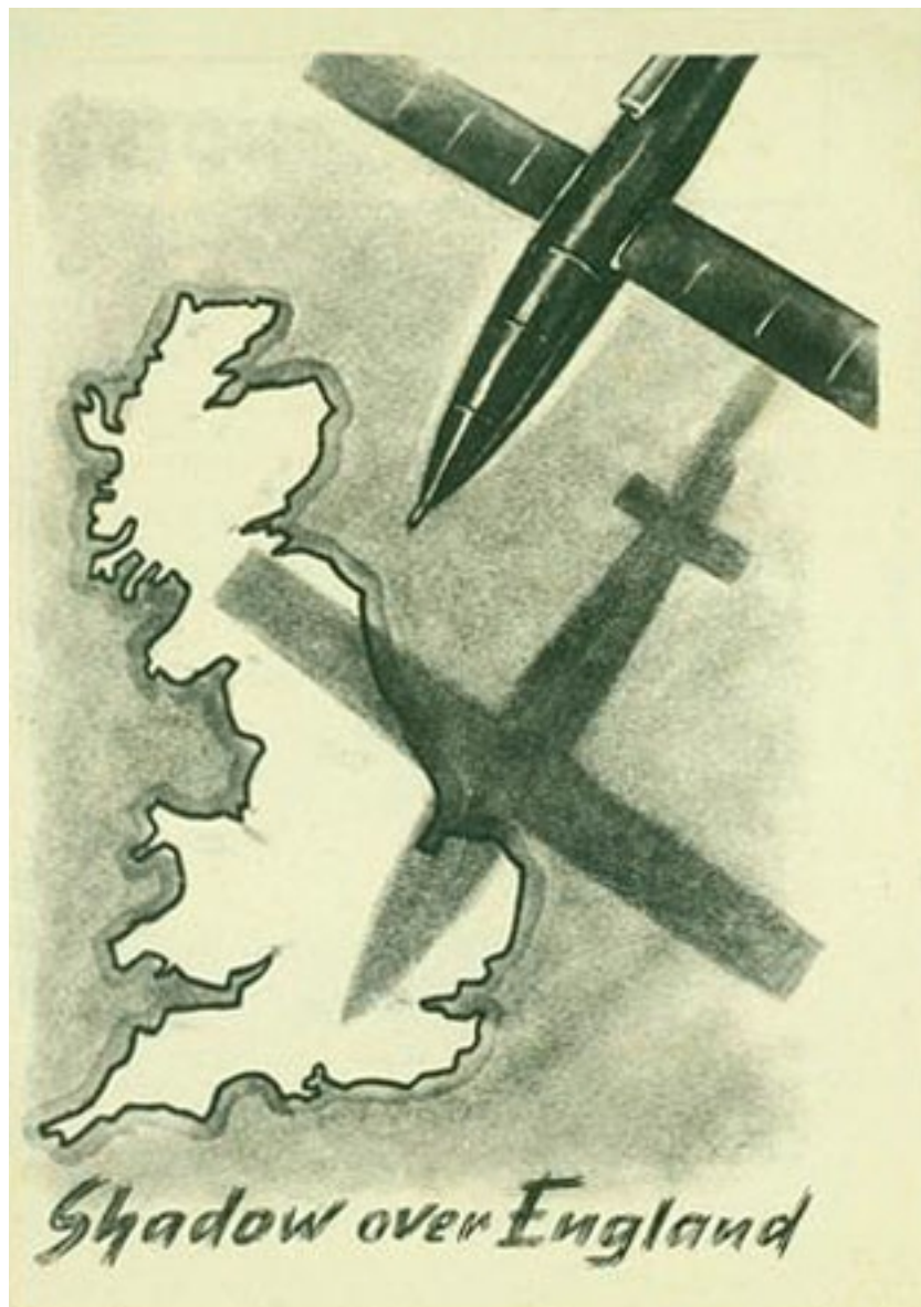
[Above: German V1 leaflets dropped on Allied armies.]

The list of National Socialist Germany's technological achievements is mind-boggling. From jet airplanes, helicopters, guided missiles, ejection seats, synthetic rubber, the submarine snorkel, the assault rifle, stealth technology, lasers, night vision, atomic research... the list goes on and on. There are numerous speculations for this technological prowess, but I believe that the Germans had a renaissance. Not only a social one, but an artistic and scientific one and in many other facets of their culture as well. They were a united people, full of pride, and had an optimistic spirit. What are your thoughts?