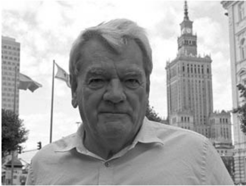
[Above: David Irving]

I have heard of Golden Dawn and yes, I am aware of the imprisonment, murder and oppression of several of their members and leaders. This is yet another example of liberal fascism at work: for if liberals and upholders of democracy really believed in what they claim to believe in – free speech, free thought, freedom of association and tolerance – then they would not be oppressing, murdering and arresting members of Golden Dawn. This is not how democracies and liberals are supposed to operate. Nay, this is allegedly how fascists operate (or so we're told).