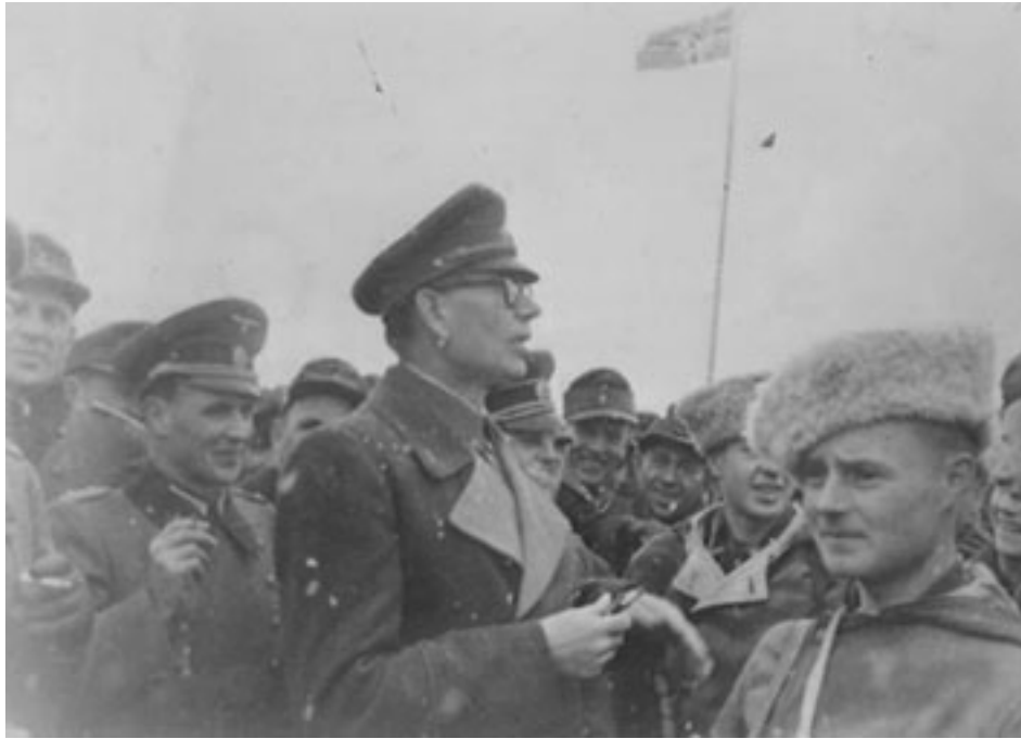
[Above: Vlasov and Russian volunteers.]

Let's move on now to the competing schools of thought, per Fischer, about the Slavs. The schools can be divided into two main camps: the Ostpolitikers and the Utilitarians. The Ostpolitikers were so bent on exploiting Russia and her masses that they were unwilling to conceive of a post-Stalin organization of the USSR. Bormann and Koch were among them. Now, while all Utilitarians rejected this viewpoint they were divided into two camps: the Slavophiles who genuinely cared about Slavs and their autonomy and the Practicalists who urged good treatment of Slavs solely for the sake of German victory. Alfred Rosenberg and most of those in the Ostministerium were Utilitarians of one type or the other. While Hitler and Himmler started off as Ostpolitikers, both ended up as Practicalists. They were forced to become so owing to Germany's military misfortunes. After Himmler met Vlasov he was still no Slavophile, but he was also not a Practicalist in the true sense. He fell somewhere between the two. He expressed respect and admiration for Vlasov and apologized to the Russian general for publishing and disseminating the pamphlet Der Untermensch . Himmler felt obligated to explain himself and told the Russian that