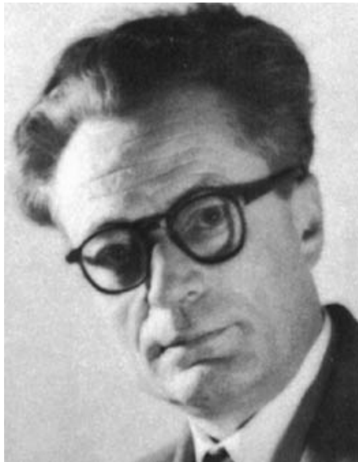
[Above: Paul Rassinier]

That said we must remember that Paul Rassinier, the unofficial “father of holocaust revisionism” started publicly questioning the accepted World War II narrative in the late 1940s and wrote about his disputations in The Lie of Ulysses (1950). Thus the information has always been there for anyone to access. The Internet has just made it much easier.