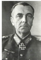
[Above: General Friedrich Paulus]

( http://quikmaneuvers.com/secrets_of_stalingrad.html )