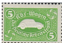
[Above: Workers volkswagon stamp to be put in a saving book to eventually buy a car!]