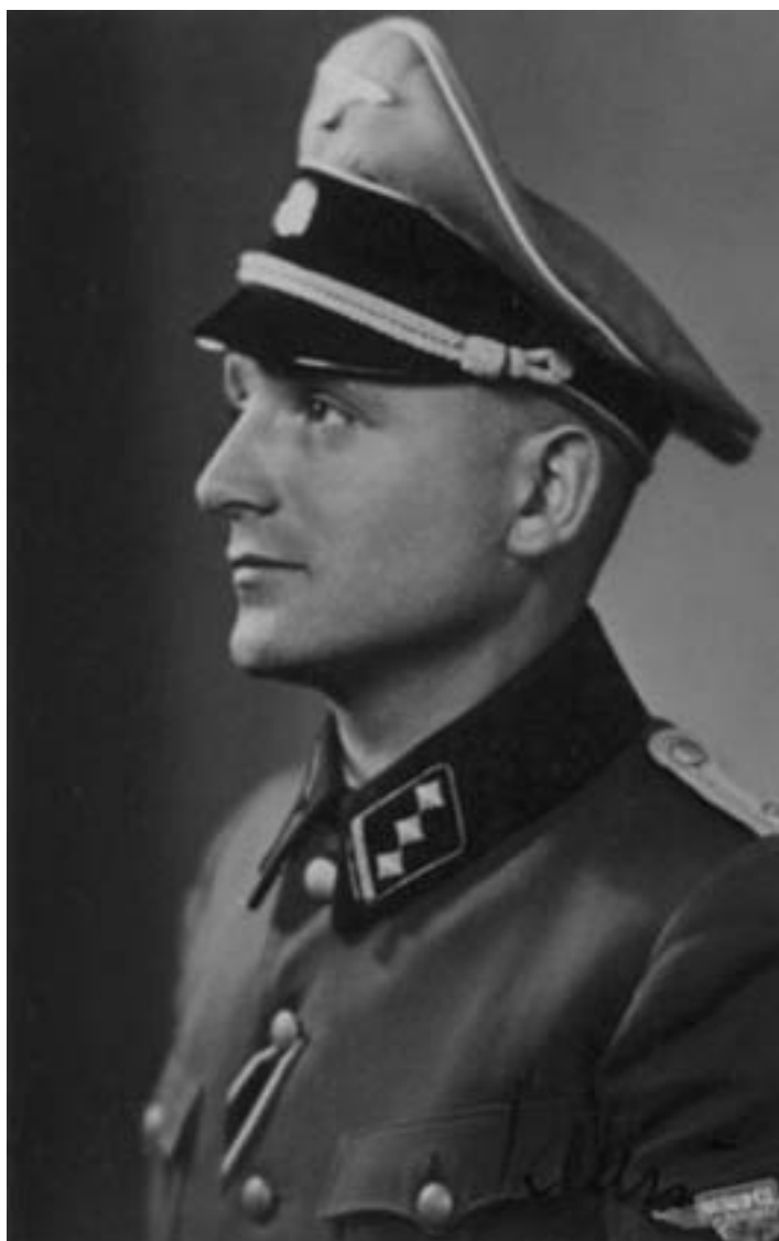
[Above: Klaus Barbie]