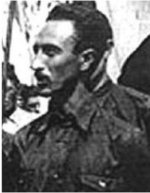
[Above: Salvador Abascal]

Further along these lines, according to one of Wertz's online screeds,