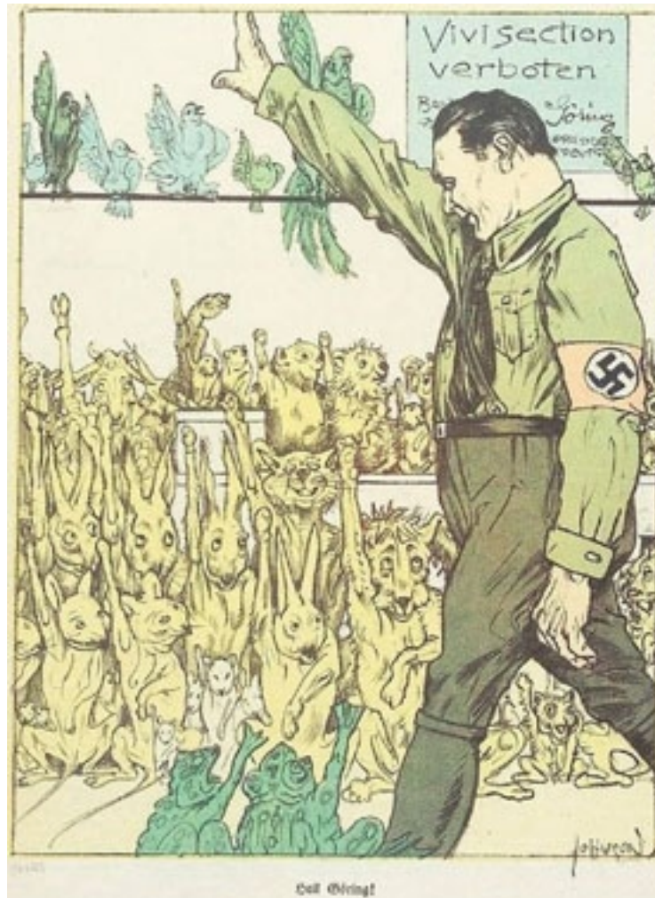
[Above: 'Heil Goering' and 'Vivisection forbidden'.]

For instance, if researchers and facilities can show that they are reducing the number of animals used for research in favor of computer modeling and other replacement research techniques and procedures, groups like PETA may be more willing to accept limited animal research. While some welfare groups refuse to accept anything but an end to animal research, at least researchers can honestly claim that they are working toward that goal. However researchers and facilities must demonstrate consistent and reliable conduct in this regard; otherwise when groups like PETA secretly film facilities abusing their animals, the debate will end up right back at square one. If a facility assures the public and animal welfare groups that it is obeying animal rights laws and that it is working toward alternative research methods, then said facility ought to be doing just that on a consistent basis.