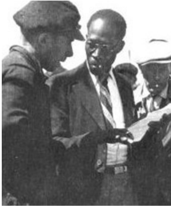
[Above: Africans assisted Germany's OT ]