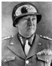
[Above: General George Patton.]

Patton was nearly killed in a number of strange incidents. He was warned that he was on a “hit list” and even told his family that he didn’t “expect to leave Europe alive.” What gives?