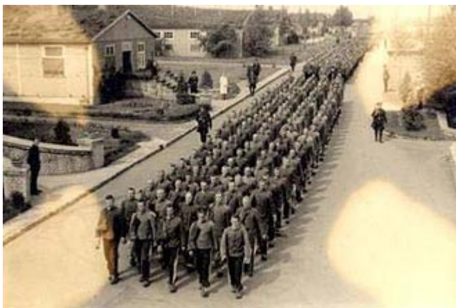
Vagrants marching to work at Esterwegen

become the crystallization point of aversion, separating them the chaff from the still useable wheat.