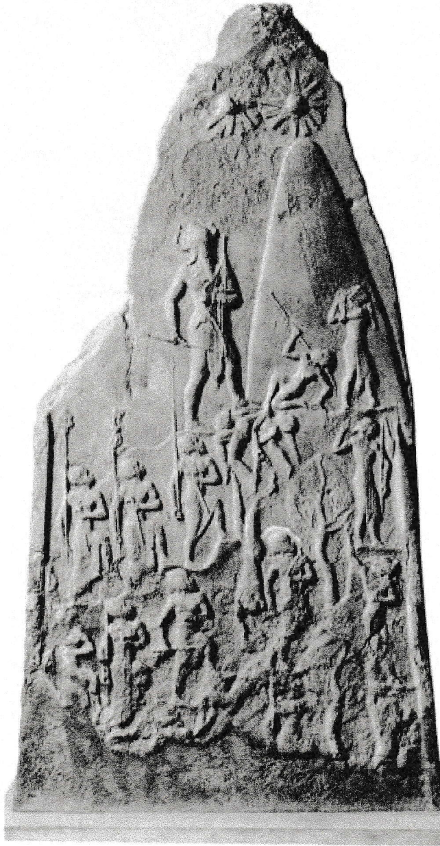
Figure 60-1. Naram-Sin Stele with Black Sun and White Sun.