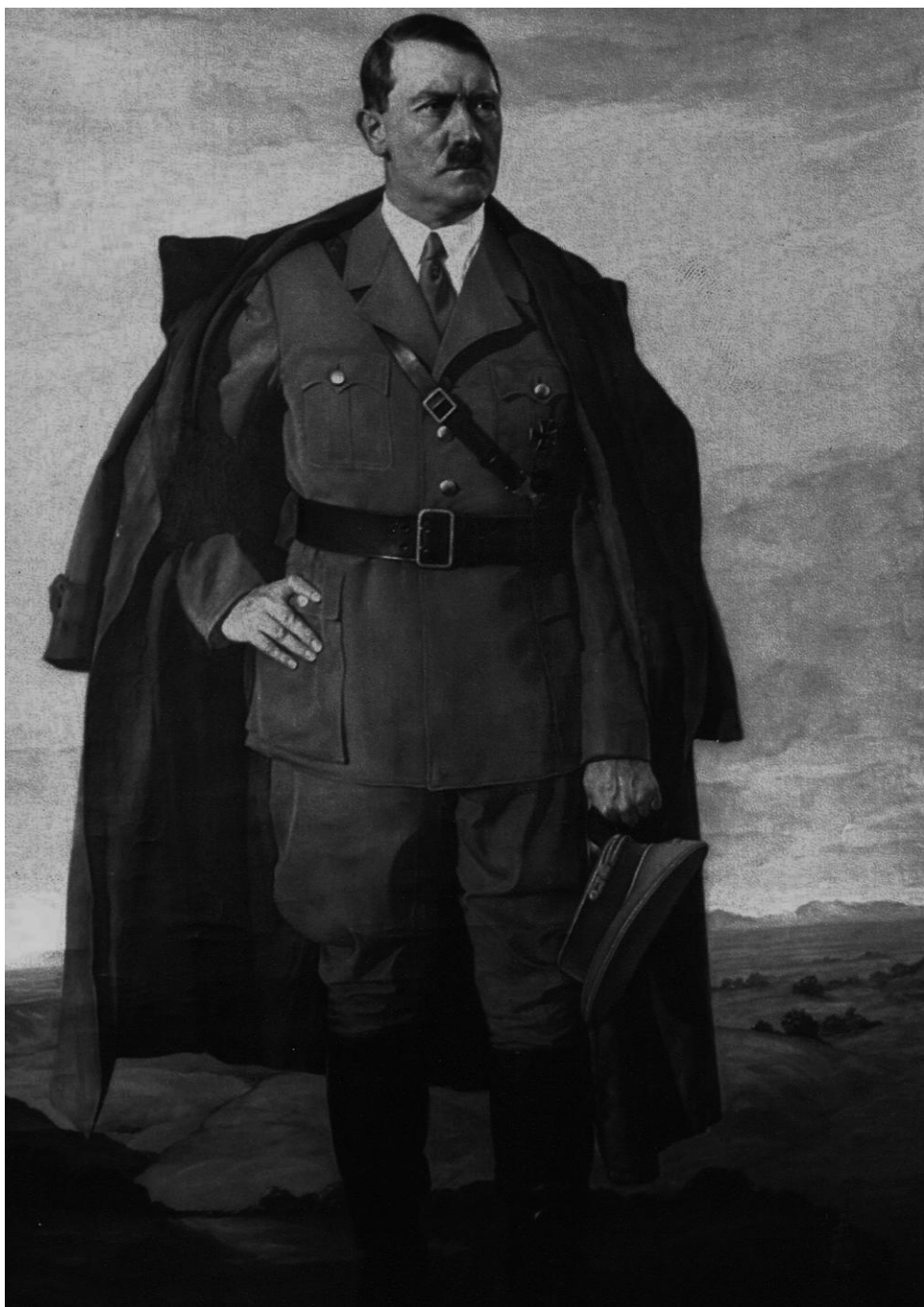
Adolf Hitler, unser Führer