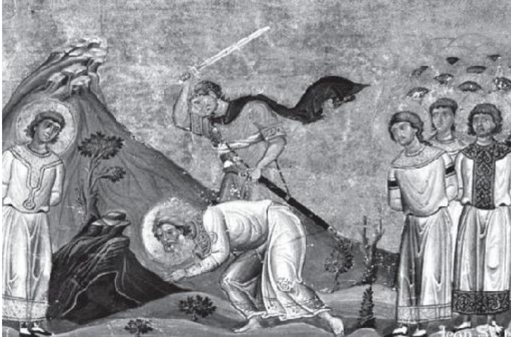
Saint Arethas and the Martyrs of al-Najran from the Menologion of Basil II.

A difference between Islam and Judaism is that whereas the Koran honour Jesus as a prophet and his mother Mary, the Orthodox Jewish Talmud , or religious codex, describes them in what we might call less than flattering terms. Hence, Islam honors the Christian martyrs of Najran, the Koran stating of them: