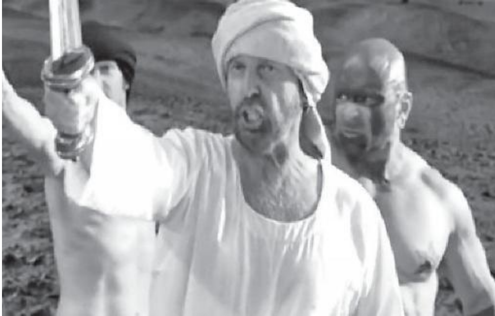
Scene from The Innocence of Muslims.