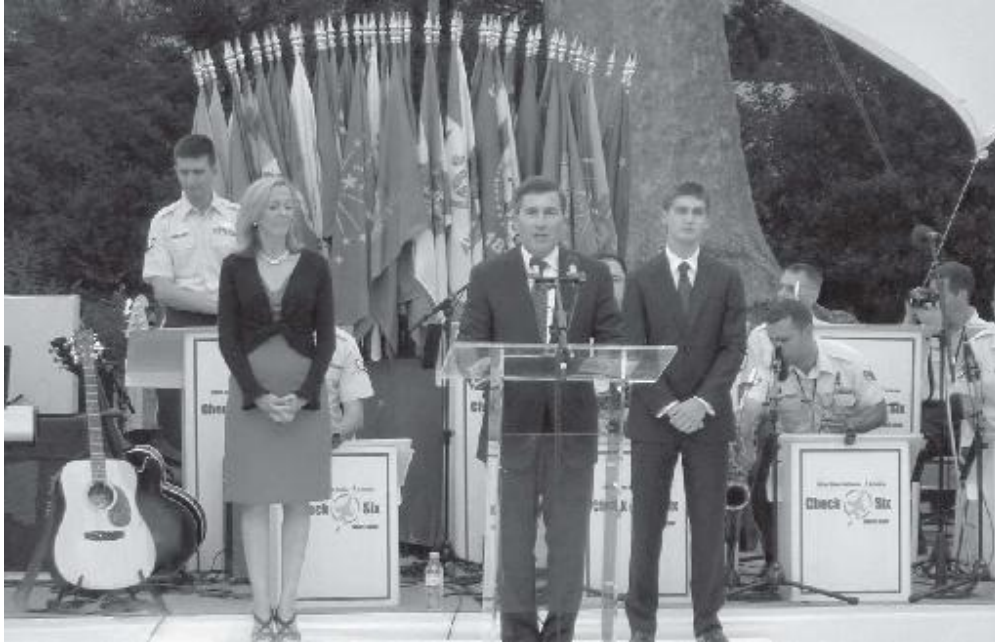
US Ambassador Rivkin speaking at event for Black History Month in Paris.

The lecture was given in three parts: part one — physical traces of African Americans in Paris (i.e. names on buildings, street signs, etc.); part two — the African-American presence in Paris which continues to permeate the city sometimes impalpably so. During this segment Dr. Wells also confronted the question ‘Is France Color Blind?’ examining it from both a cultural and historical perspective; part three — was a slide show of images of the contemporary Diaspora in Paris. 43