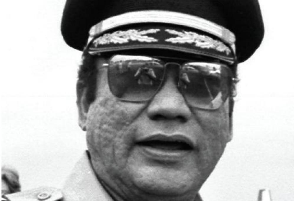
General Manuel Noriega military dictator of Panama from 1983 to 1989.