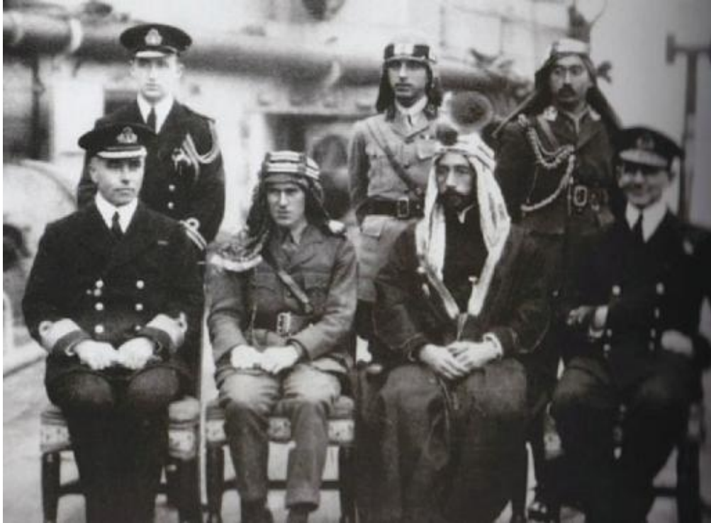
T.E. Lawrence and Prince Faisal aboard a British warship 1918.