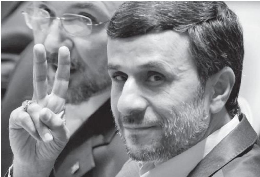
President Mahmoud Ahmadinejad gestures as he attends the United Nations

As if it weren't enough being the leader of a large Islamic nation that does not kowtow to the USA and to Israel, Dr Ahmadinejad put himself beyond redemption for eternity by suggesting that "holocaust revisionism" should be subjected to the same standards of scholarly scrutiny as any other historical matter, 1 and like the Left-wing Jewish academic Prof. Norman G Finkelstein, suggested that the holocaust was being exploited for political and economic motives. 2 Being Jewish, Left-wing and the son of parents who had survived both the Warsaw Ghetto and Nazi concentration camps, 3 didn't save Finkelstein from the Zionist smear-brigade, so Dr Ahmadinejad is not about to be cut any slack.