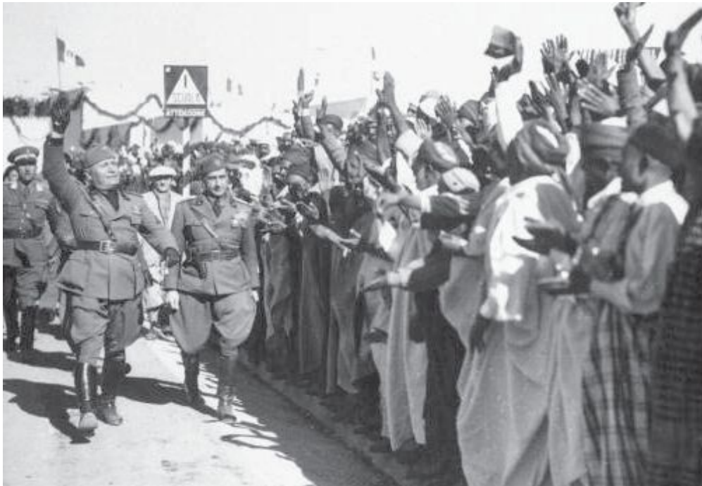
Benito Mussolini waving to resident Muslims in Tripoli, Libya. 1937.

After World War II Arab and European nationalists collaborated in opposing Zionism. The German war hero Otto Skorzeny, who had led the rescue of Mussolini from Communist partisans, taught Palestinian refugees guerrilla warfare and remained a close friend of Palestinian leader Yasser Arafat. Major General Otto Remer, harassed by the German state, served as a political adviser in Egypt and Syria for decades. Johannes von Leers, an expert on Zionism and the Middle East at the German propaganda ministry, converted to Islam, which he had long admired, and advised the Egyptian Ministry of Information, through arrangements with the Grand Mufti of Jerusalem. There were many other veterans who received sanctuary from the Arabs and in turn assisted them after World War II in their conflicts with Zionist aggression.