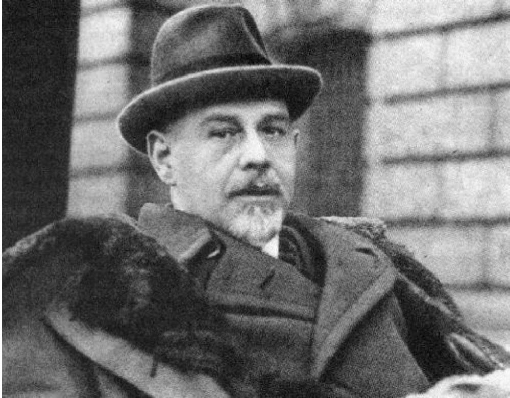
Walther Rathenau was a German industrialist, writer, and statesman who served as Foreign Minister of Germany during the Weimar Republic.