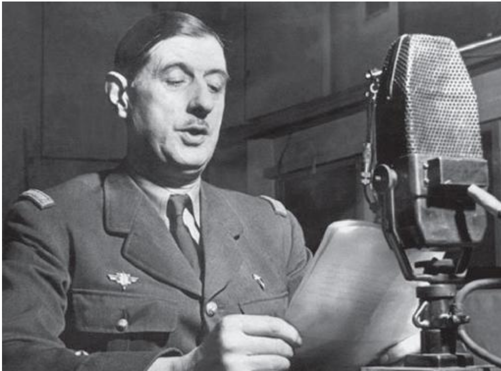
General De Gaulle in a BBC radio broadcast during WW2.