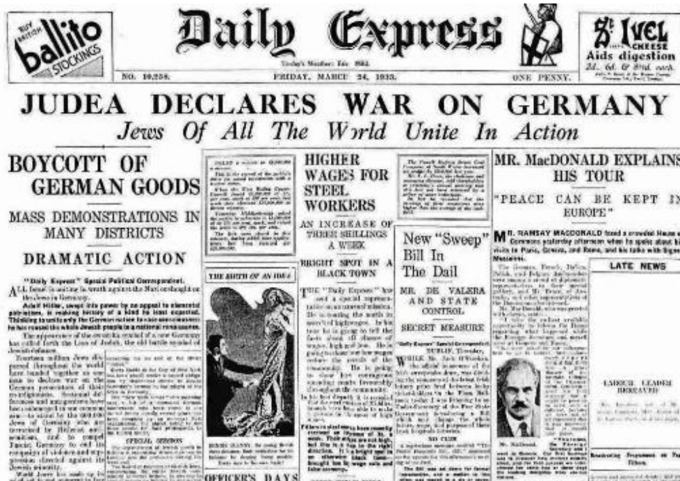
Friday, March 24, 1933, the headline “Judea Declares War on Germany” was splashed across the front page of the Daily Express newspaper.