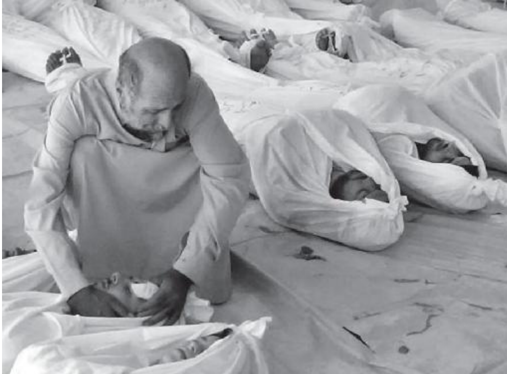
A Syrian man mourns over a dead family member after a poisonous gas attack in Damascus, Syria in August 2013.

The plan of attack against Syria has been long in the making. Arab regimes have recently fallen like dominoes as a prelude to the elimination of Syria and Iran. The Clean Break recommends the use of Cold War type rhetoric in smearing Syria. We can see the plan unfolding before our eyes. The “weapons of mass destruction” charade used to justify the US bombing of Syria takes the form of alleged chemical attacks on Syrian “civilians,” with a compliant news media showing lurid pictures of suffering children, but usually with the comment that the reports are “unconfirmed.” The US assurances of “proof” sound as unconvincing to the critical observer as the “evidence” against Saddam. The United Nations supposedly has a report proving that chemical weapons were used, but not who used them. Sure enough, reports have come out that US-backed rebels have committed the chemical attacks as a means of securing a US assault on the Assad government. Two Western veteran journalists, while captives of the Free Syria Army, overheard their captors – including an FSA General - discussing the chemical weapons attack rebels had launched in Damascus as a means of justifying Western intervention. 5