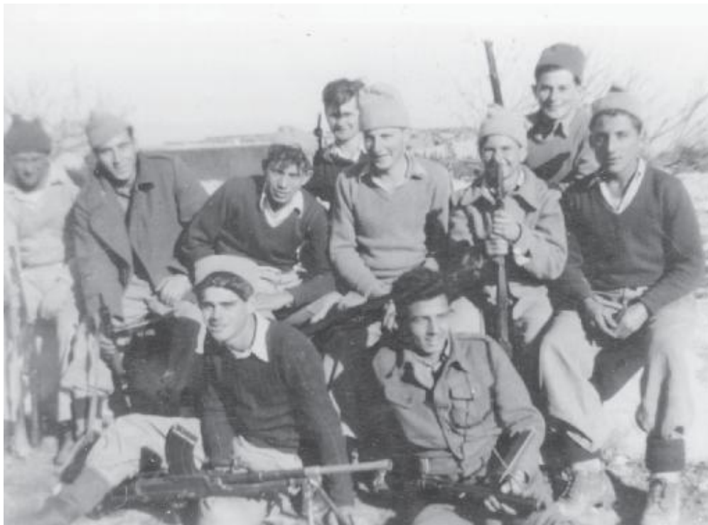
Members of a Palmach military unit Palestine 1948.