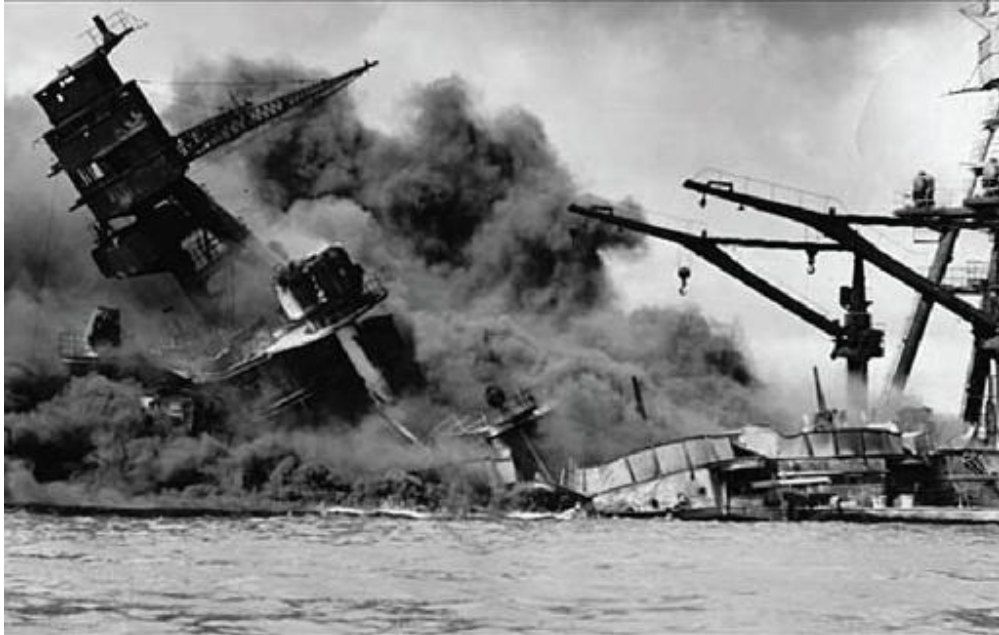
The destruction of the USS Arizona at Pearl Harbor - 7th December 1941.