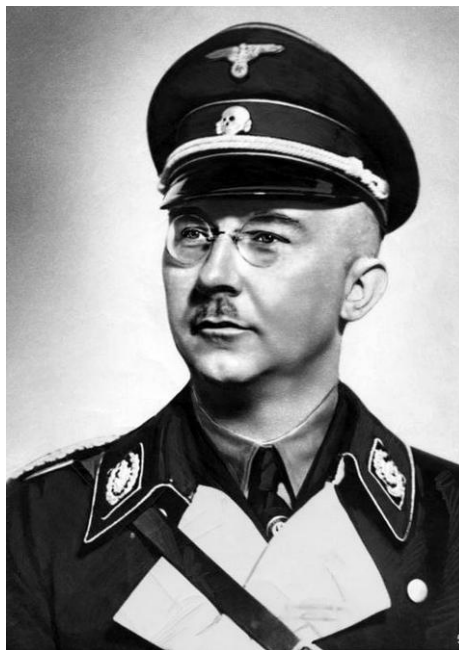
Reichsführer SS Heinrich Himmler (1938)