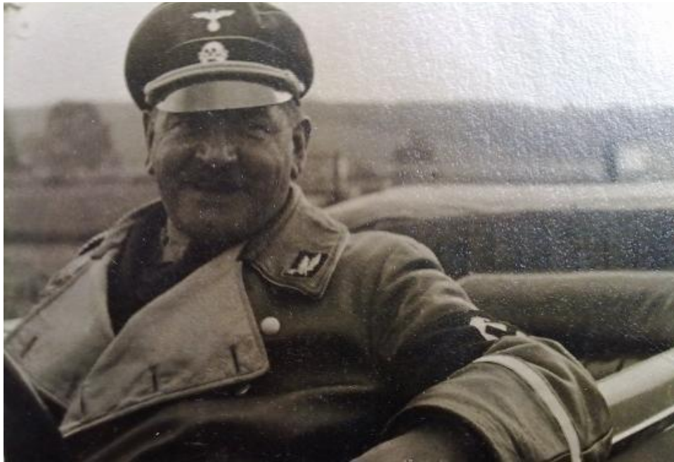
Karl Maria Wiligut was inducted into the SS (under the pseudonym "Karl Maria Weisthor") to head a Department for Pre- and Early History which was created for him within the SS Race and Settlement Main Office (RuSHA).

conceptualization of Wewelsburg Castle, where a chivalric order of SS elite would be founded as the “center of the world;” the designs for the SS Totenkopfring ; formulation of SS ceremonies; design of ceremonial objects such as a wedding bowl, and reports on history and cosmology for Himmler. 33