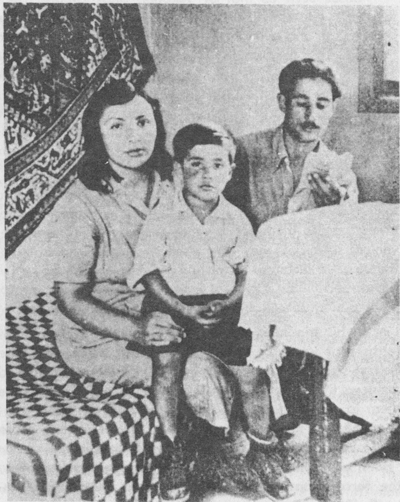
MARRANO FAMILY; THIS IS TO SAY CLANDESTINE JEWS, OF IRAN. THEY ARE PIOUS MOSLEMS IN PUBLIC AND JEWS IN SECRET.

Photo taken from the Great Jewish work titled: " Castilian Jewish Encyclopedia ". Additional volume titled " Contemporary Judaism ". Mexico, D. F. 1961. Word Marrano. p. 878, 1st. col. MODERN MARRANISM.