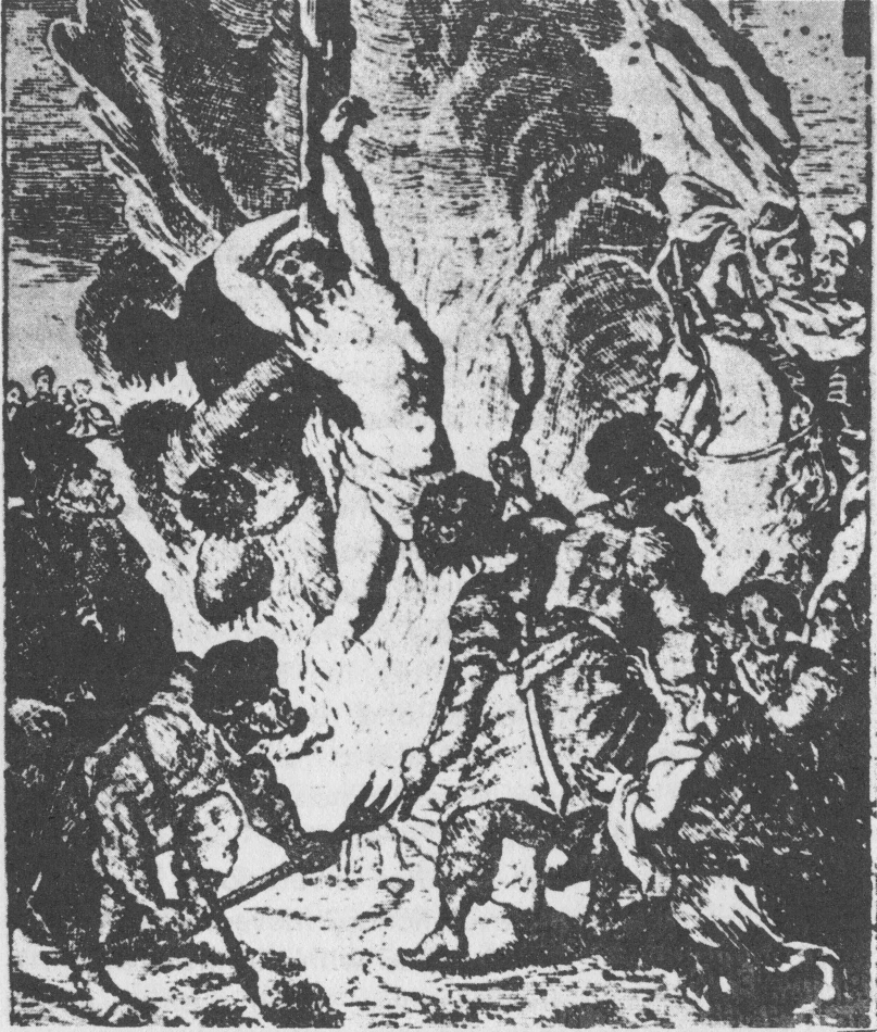
CLANDESTINE JEWS BURNED ALIVE BY THE PONTIFICAL MEDIEVAL INQUISITION.

They were Christians in public and Jews in secret. They were condemned for going to Mass and take communion as Christians, and keep the wafers taking them out of the mouth to profane them. 1370.