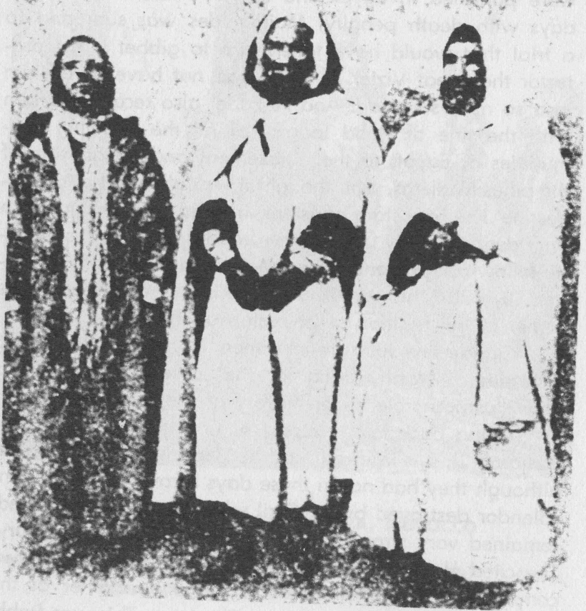
BERBER JEWS OF MOROCCO.

Photo taken of the great Jewish work titled: " Castilian Jewish Encyclopedia " 7th vol. Mexico, D. F. 1950. Word Morocco. p. 302, 2nd. col.