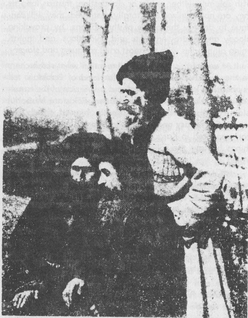
JEWISH TYPES FROM CAUCASUS.

Jewish authors say that the cradle of the Caucasian Hebrews was in Aturpakatan, called Soviet Azerbaidjan today. They have spread into Georgia — Stalin's homeland — Turkey and especially in the Caucasus. Many of them are Moslem in public and Jews in secret, in Turkey.