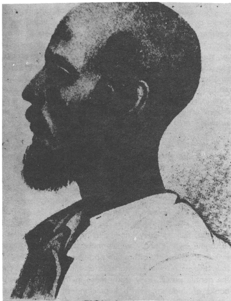
BLACK JEW OF COCHIN, INDIA.

Photo taken from the " Jewish Encyclopedia ". 4th. vol., p. 137. Word: Cochin.