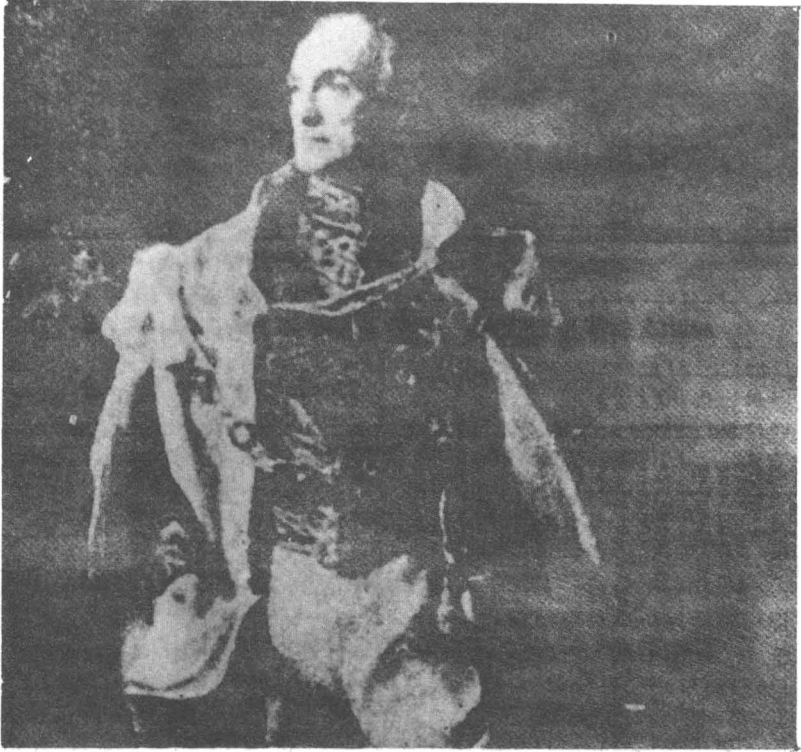
LORD READING, BRITISH JEW: VICEROY OF INDIA.

Lord Reading's true Jewish name was Rufus Daniel Isaacs. Born in London in 1860, the son of a fruit-trader, who became adviser to Queen Victoria. In 1913 he was appointed chairman of the highest Court of England. In 1917 he was awarded a title of nobility as Earl. In 1921 he was appointed Viceroy of India. After holding that high position for five years and as a reward for his services to Jewish-controlled British imperialism, he was awarded the title of Marquis of Reading, to be inherited by his successors.