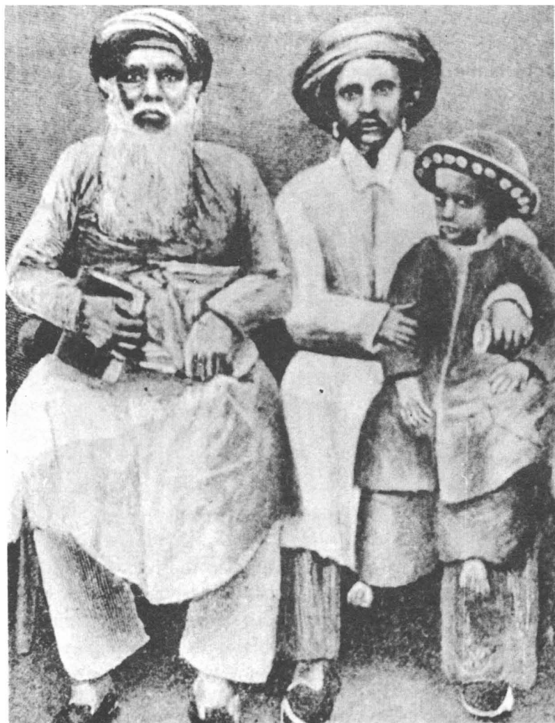
WEALTHY JEWS OF INDIA, MEMBERS OF THE BENI-ISRAEL SECT.

These Beni-Israel Jews of India have infiltrated the trading classes. Photo taken from the " Jewish Encyclopedia ", an official and monumental work of Judaism. (Published in New York and London, Funk and Wagnalls Co., 1902). 3rd. vol. Word: Beni-Israel, p. 18.