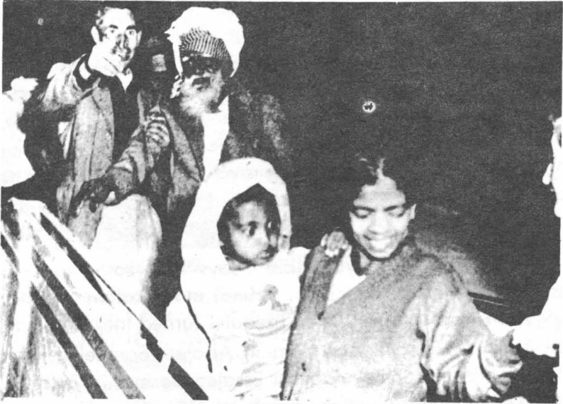
FAMILY OF BLACK JEWS FROM COCHIN, INDIA, ARRIVING AT LOD AIRPORT IN ISRAEL.

Jews members of this sect in India are generally fishermen, fruit-sellers, workers, employees, woodmen and oil millers. Photo taken from the " Castilian Jewish Encyclopedia ". Additional volume titled " Contemporary Judaism ". Word: India. 623-624 cols.