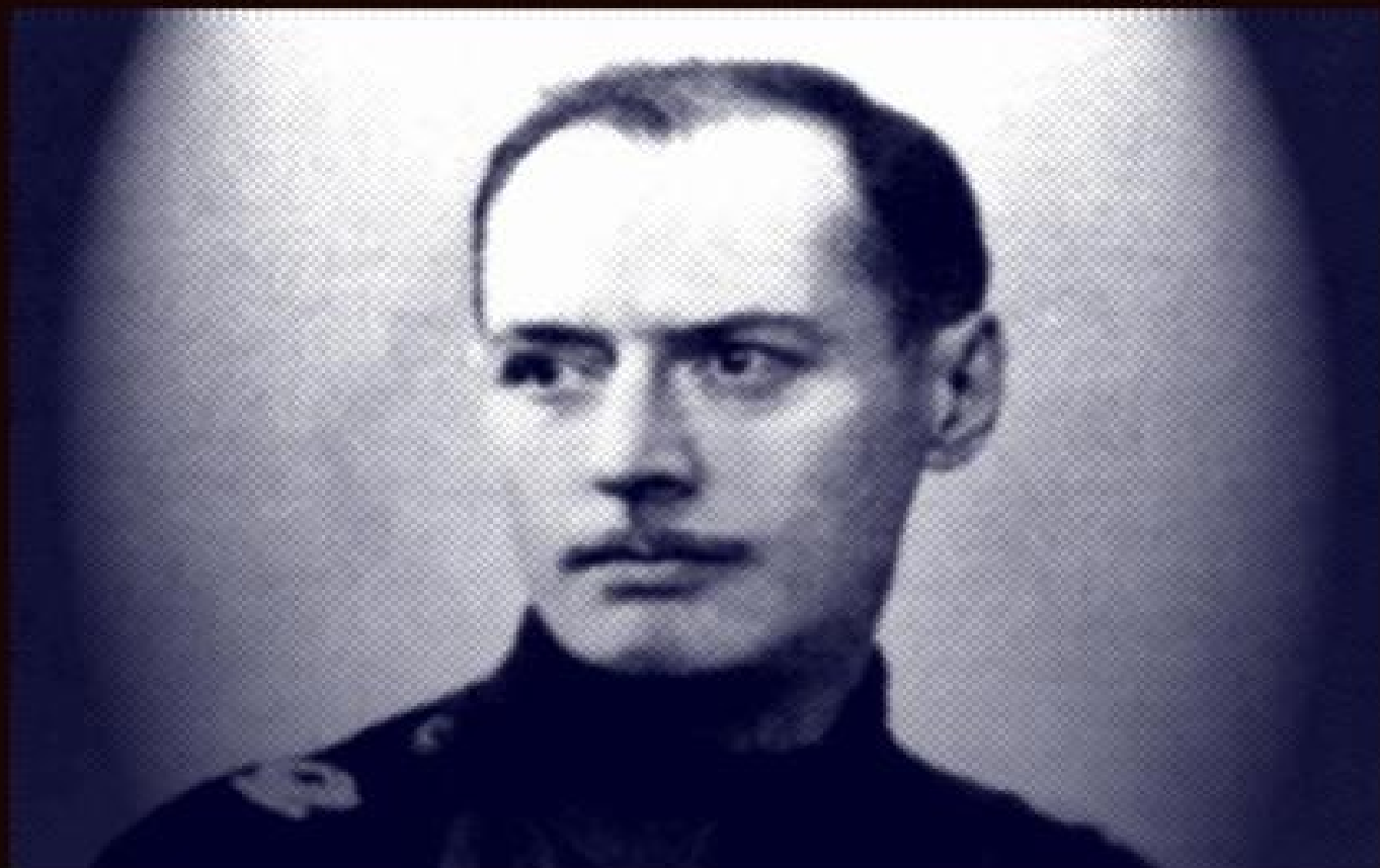
Adrien Arcand, 1899-1967