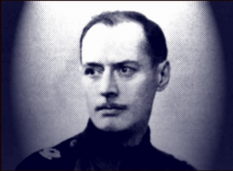
Adrien Arcand, 1899-1967