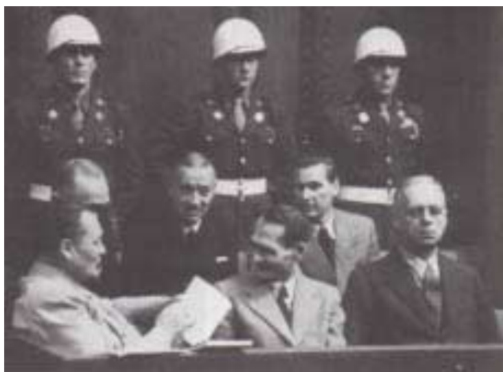
In the dock at Nuremberg, 6 December 1945, Hermann Göring and Rudolf Hess share a joke. One week earlier, Hess had admitted that he had been faking his amnesia all along for tactical reasons.

Göring slapped his thigh with delight that Hess — their very own Rudolf Hess — had swindled the tribunal and its pompous psychiatrists. “Any doubts I had,” he confessed to Hess, “left me when you failed to recognize Haushofer at that confrontation.”