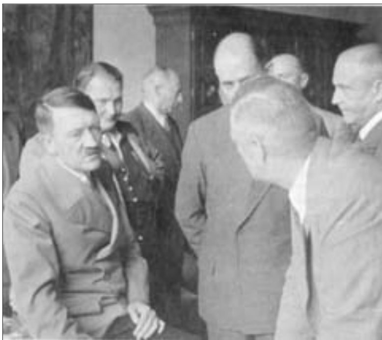
A rare candid snapshot of Hitler — taken by Adjutant von Below — at the famous secret meeting at the Berghof, August 22, 1939. Visible among the plain-clothed generals are (left to right) Göring, Manstein and Brauchitsch.

After lunch he told them why Germany had no cause for apprehension: The Luftwaffe had 390,000 men, compared with Britain’s 130,000 and France’s 72,000. The enemy might blockade Germany, but they surely would not fight. “I have only one fear,” he bragged, according to the reliable notes that Vice-Admiral Wilhelm Canaris took, “that at the last moment some Schweinhund may offer to mediate.” As he concluded (“I have done my duty, now you do yours!”), Hermann Göring waddled importantly forward, mounted a step, and turned to face his Führer. “The Wehrmacht,” he promised, “will do its duty.”