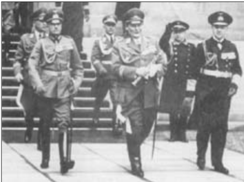
On April 20, 1939, his fiftieth birthday, Hitler secretly told his three commanders-in-chief to expect war soon — probably that year. Shown here (left to right) are Field Marshal Walther von Brauchitsch (army), Reichsmarschall Hermann Göring (air force) and Grand Admiral Erich Raeder (navy).