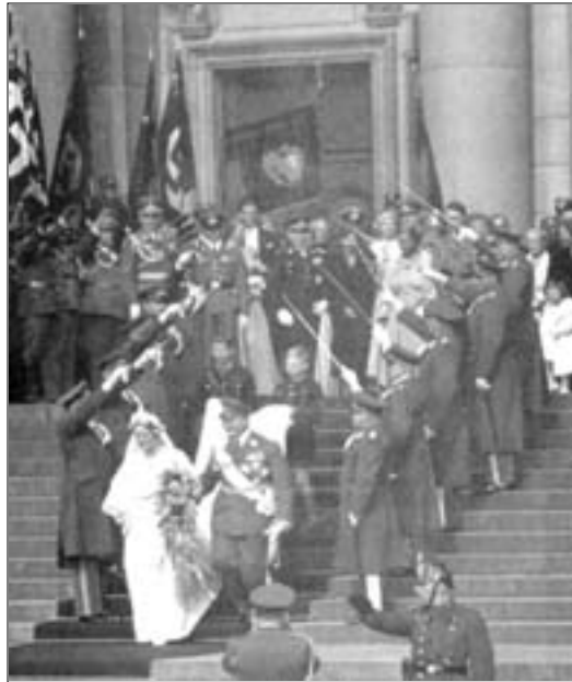
The sumptuous 1935 wedding of Hermann Göring to Emmy Sonnemann put an end to two years of scandal and rumor.