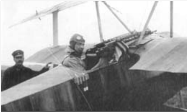
By the end of World War I Hermann Göring was one of Germany's top-scoring fighter aces.