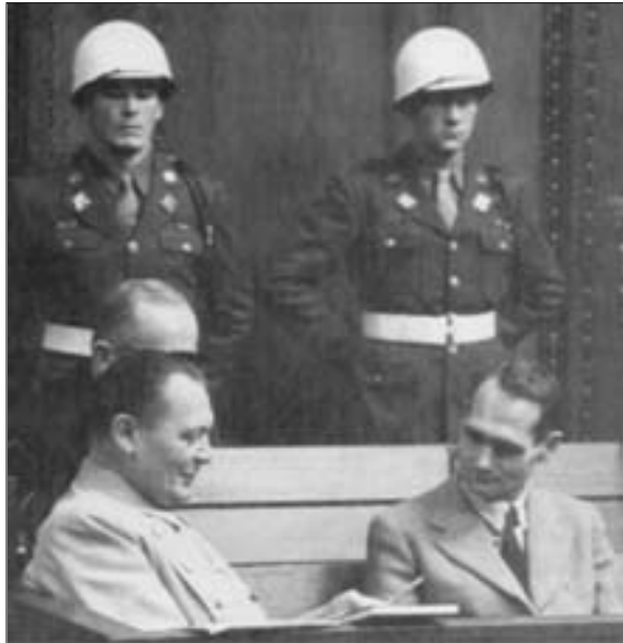
In the dock at Nuremberg, Göring found himself seated next to Rudolf Hess, Hitler’s “truant” deputy.

The British presiding judge, Sir Geoffrey Lawrence, interrupted him. Göring doggedly began again, and Jackson caught his breath. But Lawrence firmly halted the defendant.