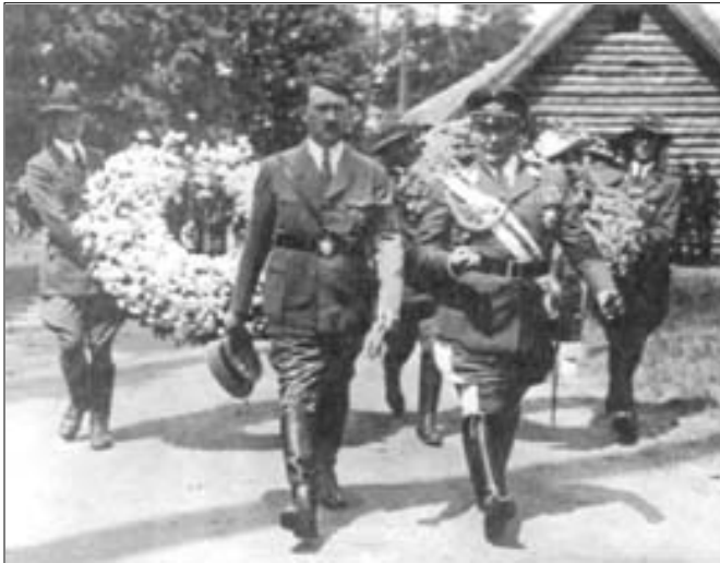
June 20, 1934: Göring's dream comes true as his first wife, Carin, is reburied in a stone crypt on the Carinhall estate while a bareheaded Führer and the Reich's top dignitaries pay homage to her.

Göring had invited Carin's relatives, along with hundreds of diplomats and politicians, to witness this moving evidence of how beholden he still was to her memory. To the blare of hunting horns and trumpets, and the answering bellows of Hermann's future trophies grazing in the forests, a dozen strong men groaned and strained to manhandle the sarcophagus down into the granite mausoleum. Afterward, Göring led Hitler down the steps alone. Both men had known Carin well, both were saddened that she had not lived to see the National Socialists triumphant. Göring's most intimate accomplices — Himmler and Körner — looked on. With him these two men were to become, in Darré's compelling phrase, the "managers" of the coming Night of the Long Knives.