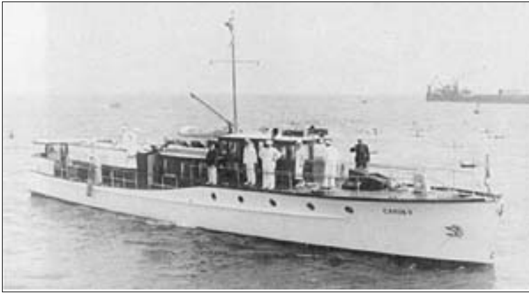
Göring's motor yacht Carin II was a gift of the German automobile industry.