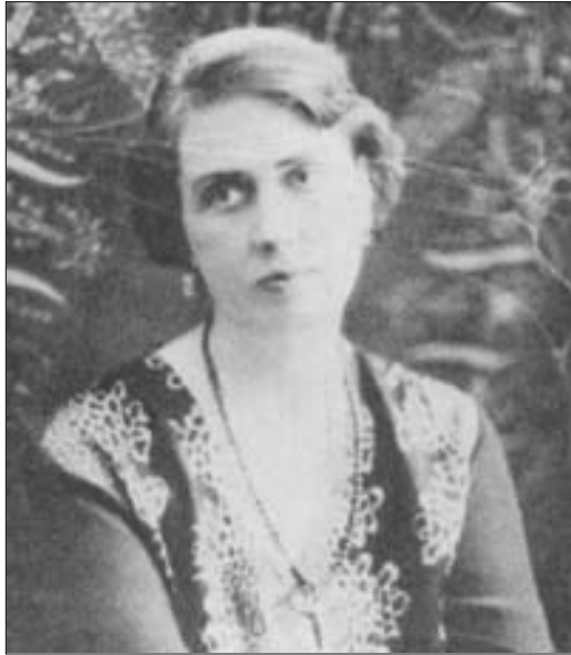
Soulful and mystically inclined, Carin von Fock became Göring's first wife in 1923.

Whatever the origins of their meeting, Göring fell deeply in love with Carin von Fock. She was nearly five years older; she was different from any other woman he had set eyes on. She showed him the tiny chapel of the family's private Edelweiss Order nestling behind the castle, and Hermann detected in her something of the maternal feeling that he