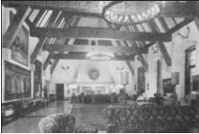
Göring designed the interior of Carinhall to resemble a Swedish hunting lodge.