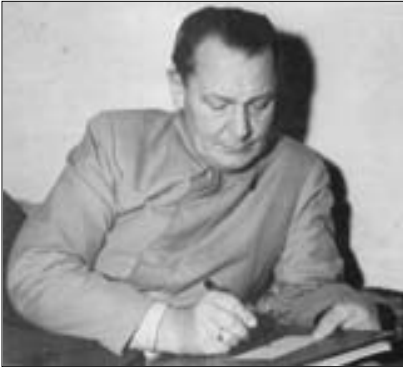
In his Nuremberg prison cell, November 23, 1945, Göring pens a postcard to his wife. For months he wondered why there were no replies.

“I am not a heart specialist,” he warned the colonel. “I have no heart instruments to make a proper examination.”