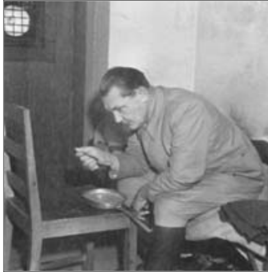
Prison fare at Nuremberg was a plate of soup. The surroundings were less luxurious than Göring had been accustomed to.