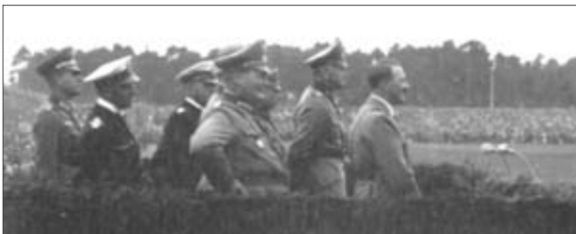
In 1934 all was harmony with Hitler’s commanders as he rebuilt the German armed forces. Flanked by (left to right) Raeder, Göring, Fritsch and Blomberg, Hitler reviewed the Armed Forces Day parade. In 1938 Blomberg and Fritsch, victims of two sordid scandals, quit, leaving Hitler and Göring with absolute power.

Göring also became the leader in high society. His annual ball became the event of the winter season. But when the first was held, on January 11, 1935, in his State Opera House on Unter den Linden, Nazi purists wrinkled their noses. “Göring’s Opera Ball,” sneered Darré in his diary. “Wrong. The old Court Ball — do we have to put on airs like this?”