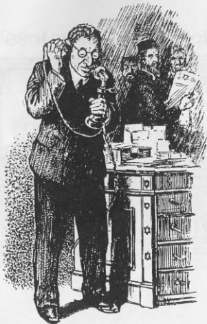
"Is that the General News Office? Well, I want some of your best boyth to dithcover Nazi plots".