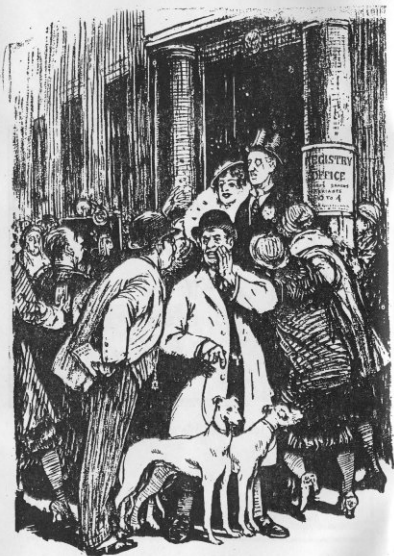
ASSIMILATION: " We don't let our dogs do that "