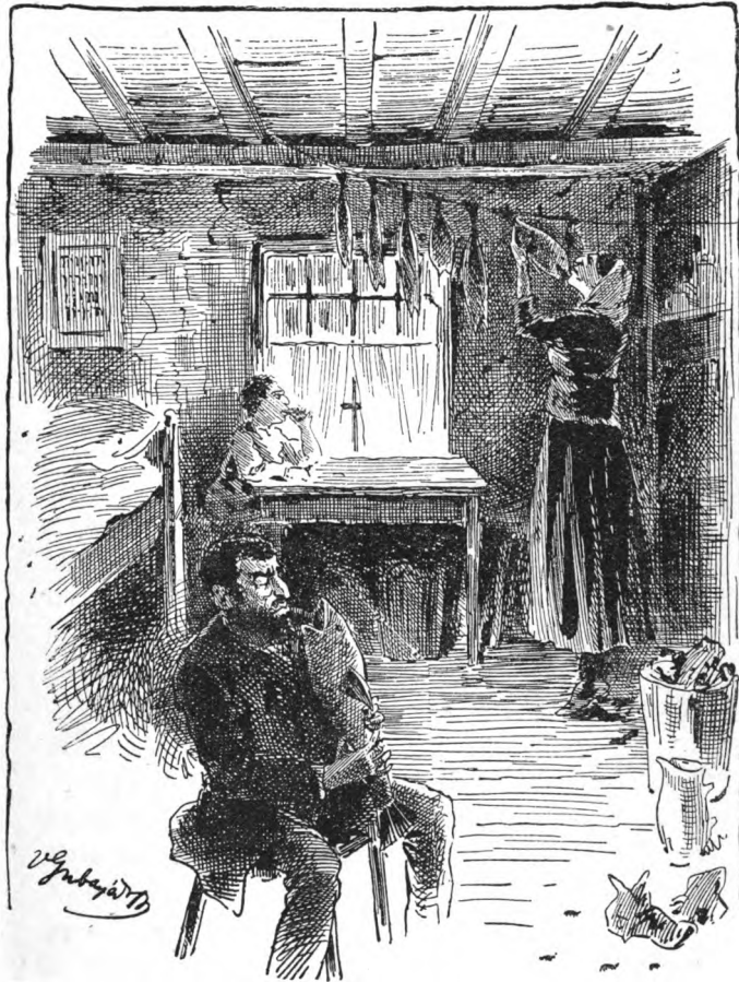
STORING THE STALE FISH OVER NIGHT.