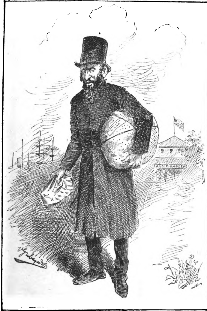
THE JEW IMMIGRANT.