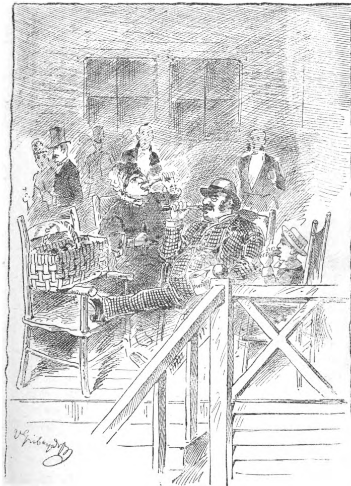
ON THE SUMMER-HOTEL VERANDA.