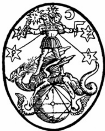
Figure 2. The Rebis of Basilius Valentinus: reproduction from Aurelia Occulta Philosophorum, in Theatrum Chemicum, Strasbourg, 1613, vol. IV.

This dragon and globe have disappeared in the plate of our booklet, as has the word Rebis found on the androgyne's chest. In exchange, this Rebis