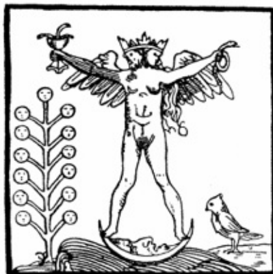
Figure 1. Hermetic androgyne from the Rosarium Philosophorum , reproduction from vol. II, p. 291, of Artis auriferae quam Chemicam vocant , Basel, 1593.