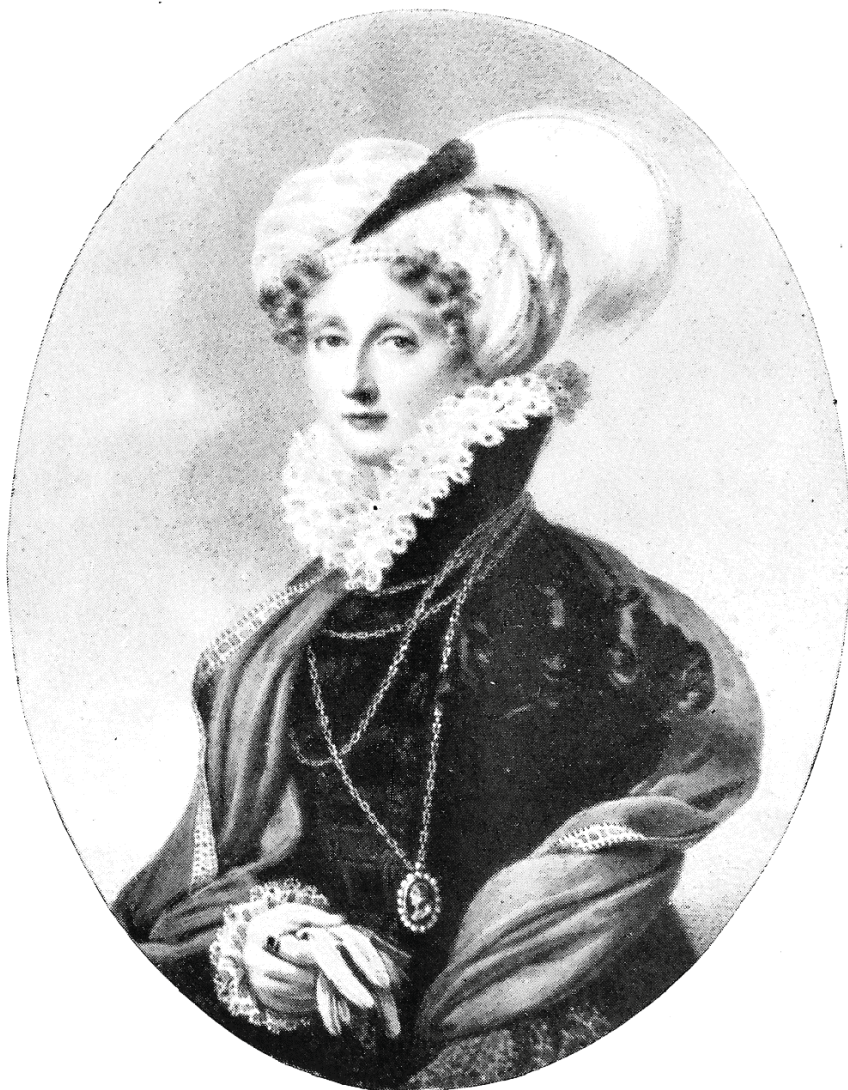
H.M. MARIE AMÉLIE, QUEEN OF THE FRENCH, 1828