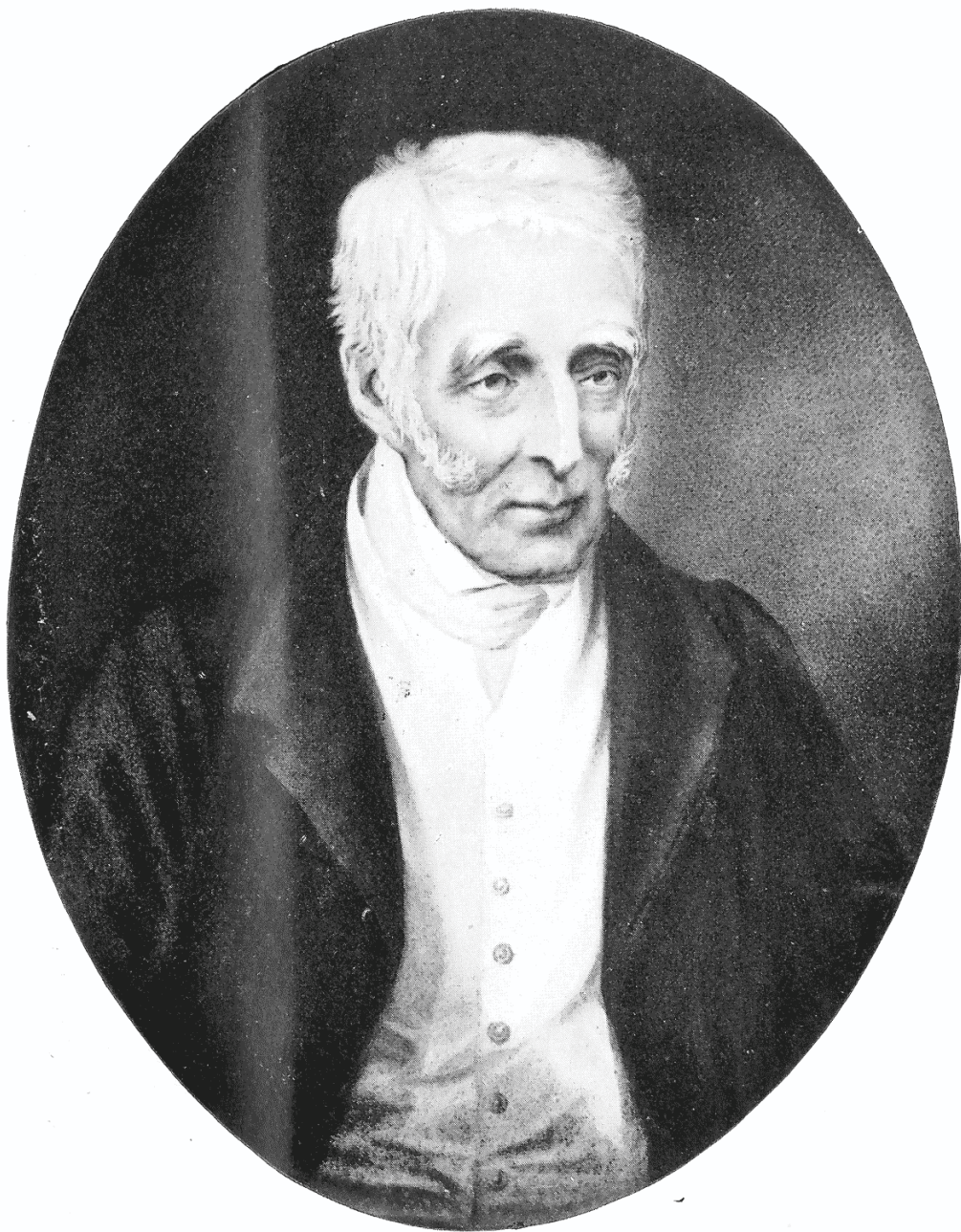
F.M. THE DUKE OF WELLINGTON, K.G.