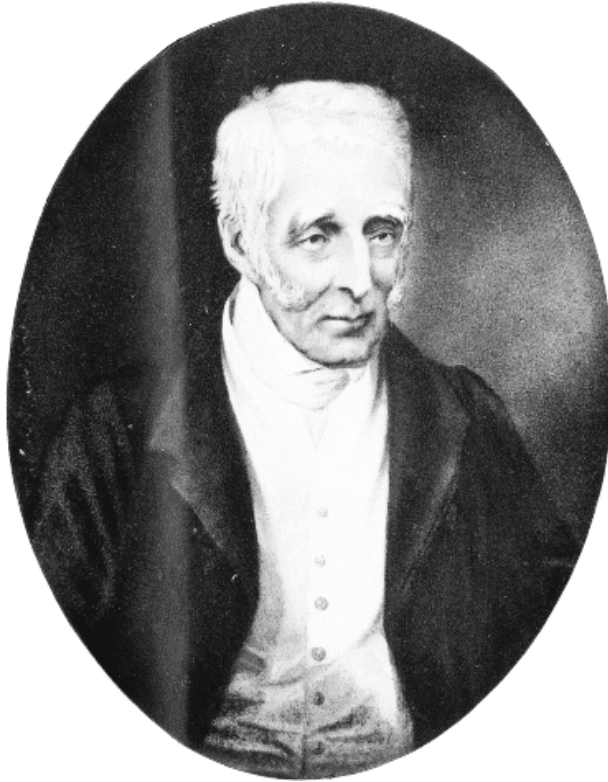
F.M. The Duke of Wellington, K.G.