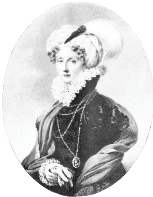
H.M. MARIE AMÉLIE, QUEEN OF THE FRENCH, 1828.

Footnote 23: A name by which the Duc de Montpensier was sometimes called in the family circle.