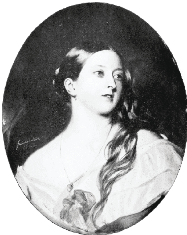
H.M. QUEEN VICTORIA, 1843

From the picture by F. Winterhalter at Windsor Castle