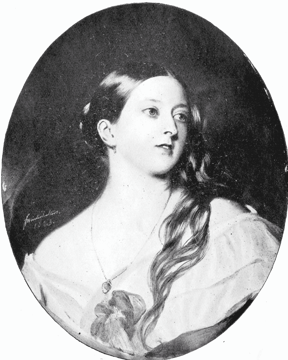
H.M. QUEEN VICTORIA, 1843

From the picture by F. Winterhalter at Windsor Castle