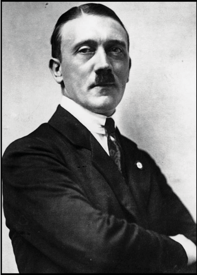
Adolf Hitler 1889-1945