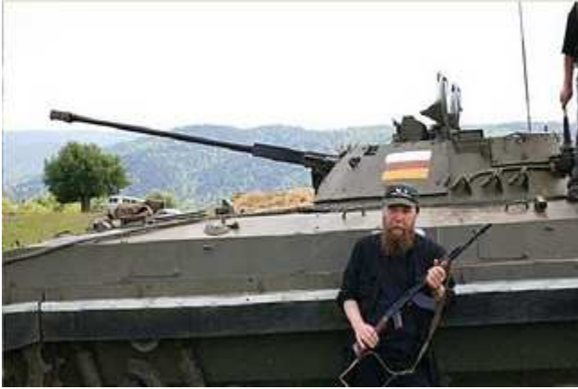
Mr. Aleksandr Dugin and his tank.