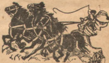
WHO WAS ODIN?

I, the deed propounder— Choosing one—or—millions— I, all the Christs defiant— Lord of Ignis Ardens.