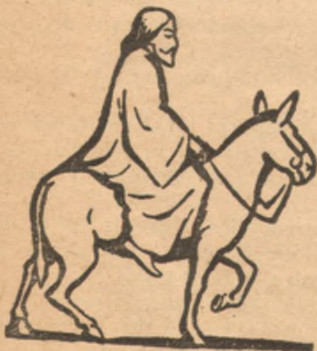
GOD ON A

But the God we own, the Wonderful, He doth them all surpass — An Asiatic yellow man A Hebrew on an ASS.