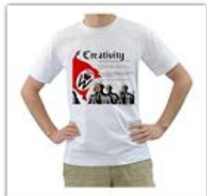
Creativity Legions - T-Shirt $15.99