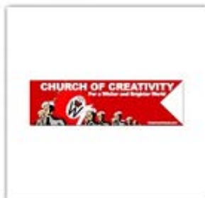
Church Stickers (10 pack) $14.88