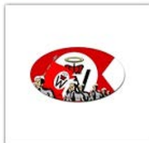
Church Stickers - Oval (10 pack) $9.99