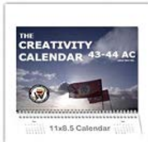
Creativity Calendar $14.88