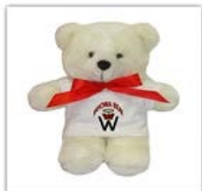
Rahowa theTeddy Bear $11.99