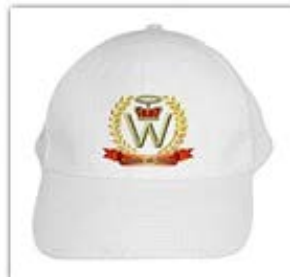
Church Logo Gold - White Cap $10.99