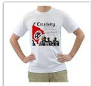
Creativity Legions - T-Shirt $15.99