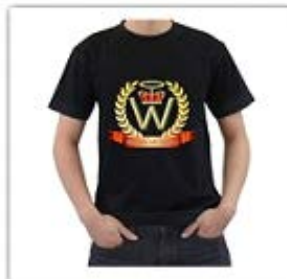
Church Logo Gold - T-Shirt $16.99