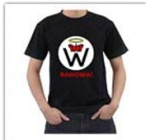
Creator Logo Black T-Shirt $16.99

All order requests can be made via Admin@creativityalliance.com