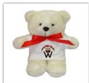
Rahowa theTeddy Bear $11.99