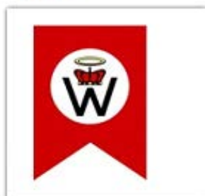
Church Flag - Large Vertical $21.00