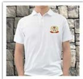
Church Logo Gold - Shirt $14.88