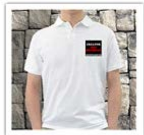
Creator - Not Skinhead - Shirt $15.99