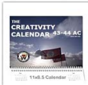
Creativity Calendar $14.88