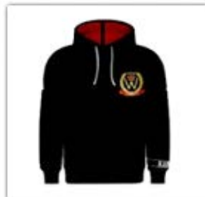
Creativity - Men's Hoodie $51.99