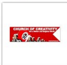
Church Stickers (10 pack) $14.88