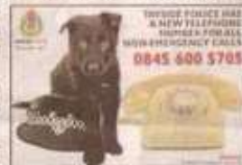
Card: The police mailshot

Tayside Police said they chose the image of Rebel in light of the puppy's popularity with online users - his blog has attracted thousands of visitors.