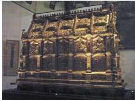
Maccabees Shrine, venerated in St. Andrew's Church, Cologne, Germany.