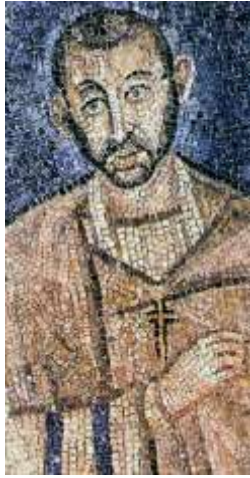
Mosaic of Ambrose 14

An outstanding personality in which the virtue of the Roman with the spirit of Christ was united to give a complete unity: man, bishop and saint from the feet to the head. Together with Theodosius the Great, the most important figure of his time, the counsellor of three emperors, the soul of their religious policy and the support of their thrones: a formidable champion of the Church.