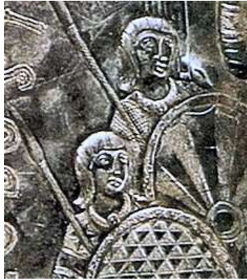
Gothic soldiers on the Missorium of Theodosius I, made in 388 AD.

Vistula in the ‘transition period’, about the year 150 on the Black Sea.