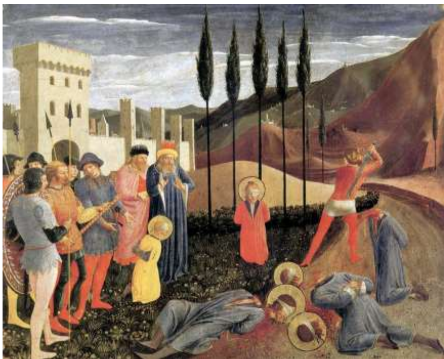
Fra Angelico, Beheading of St Cosmas and St Damian (1439-42), Musée du Louvre: a pair of saints that probably not even existed.

Fabrications of this kind were also found in another very different, though interdependent, field of ecclesiastical politics. Just as in order to increase the faith the written statements about false martyrs were created to increase the clerical power, false catalogues of bishops were made. That is, little by little an apostolic origin was attributed to all episcopal sees.