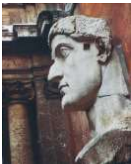
Profile of Constantine

The central point of the new capital of Constantine, which was named after him, was the court: of exaggerated luxury in the Oriental manner, built iubente Deo , that is, by divine order, on a land four times more extensive than the old Byzantium, and with the help of forty thousand Goth operatives. With the founding of this ‘New Rome’ the former capital of the empire was definitively relegated to a second place; the influence of the Hellenic East was reinforced and the conflicts between the Eastern and Western Church became acuter. Constantine, on the other hand, surpassed the old emperors when he named his palace, a prototype of the primitive basilica and ‘house of the king’ not ‘encampment’ ( castra ) like the former houses, but temple ( domus divina ) in the image and likeness of the celestial throne room. The throne room was shaped like a basilica as if it were a sanctuary, and a ceremonial of strong ecclesiastical flavour was created, which later the Byzantine emperors intensified, if possible.