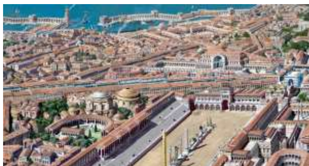
The capital of the Empire: Constantinople