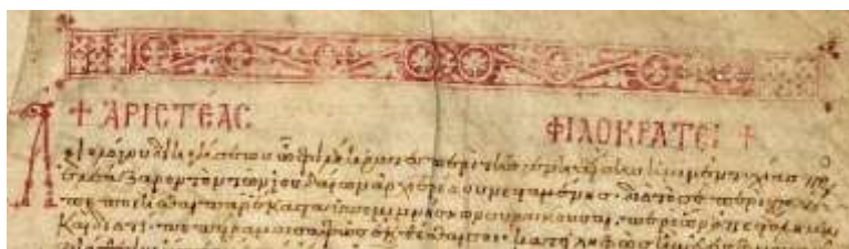
Beginning of Aristeas' letter (Biblioteca Apostolica Vaticana).

Within this context we can mention the famous Judeo-Alexandrian Letter of Aristeas , written for recognition and exaltation of the Pentateuch of the Septuagint, Jewish law and of Judaism: apparently written in the 3rd century BC, although probably authored in the 2nd if not in the 1st century.