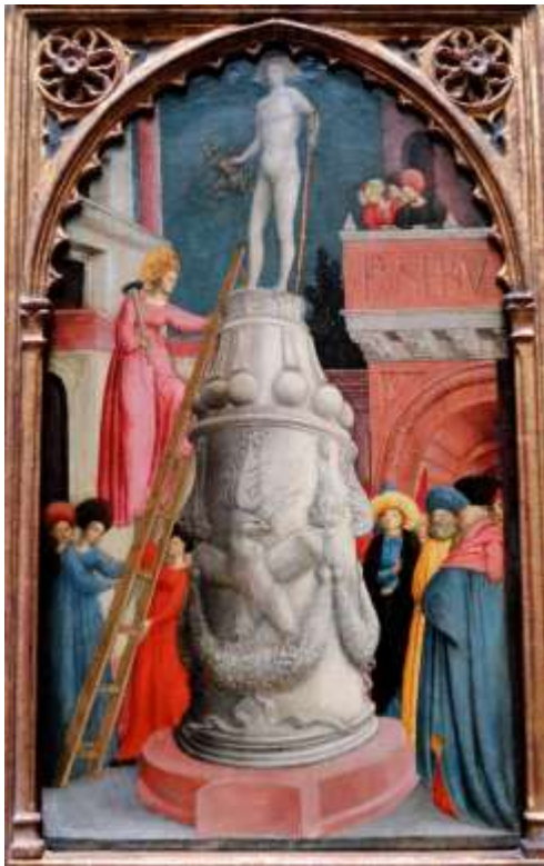
Giovanni d'Alemagna's painting on St. Apollonia destroying a Roman sculpture with a hammer.

At the time, in June 401, Augustine again incited the destructive rage. In a Sunday sermon in Carthage, he congratulated himself about the fervour against 'idols', and mocked them so primitively that the listeners laughed. At the foot of the golden-bearded statue of Hercules, we read Herculi Deo (God Hercules), Who is? He should be able to say it. 'But he can't. He remains as silent as his sign!' And when he remembers that even in Rome the temples have been closed and the idols have been thrown down, a clamour resounds throughout the church: 'As in Rome, also in Carthage!' Augustine continues to stir: the gods have fled Rome to come here. 'Think about it, brothers, think about it! I already said it, do it now!'