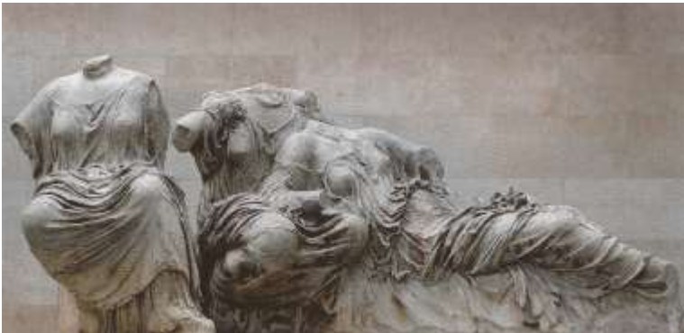
Hestia, Dione and Aphrodite mutilated by fanatic Christians.

Constantine burned Porphyry’s controversial writings. From the year 330, when Neo-Platonism was forbidden, Christians abounded in the looting of temples and the breaking of the statues, as all Christian chroniclers celebrated and despite such activities having been implicitly prohibited by the Council of Elvira.