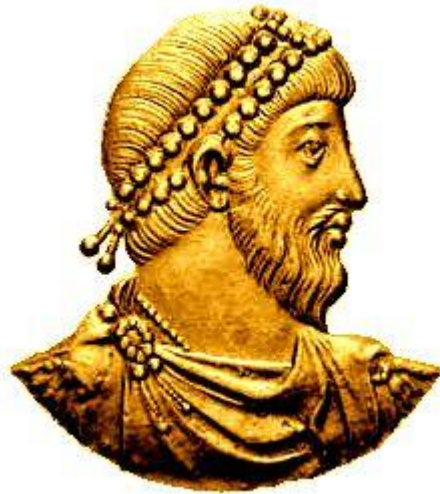
Table of Contents CHRISTIANS.