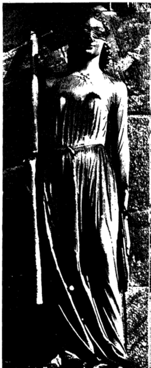
5 Left: Mary Magdalene, from the Holy Sepulchre. Augustiner Museum, Freiburg