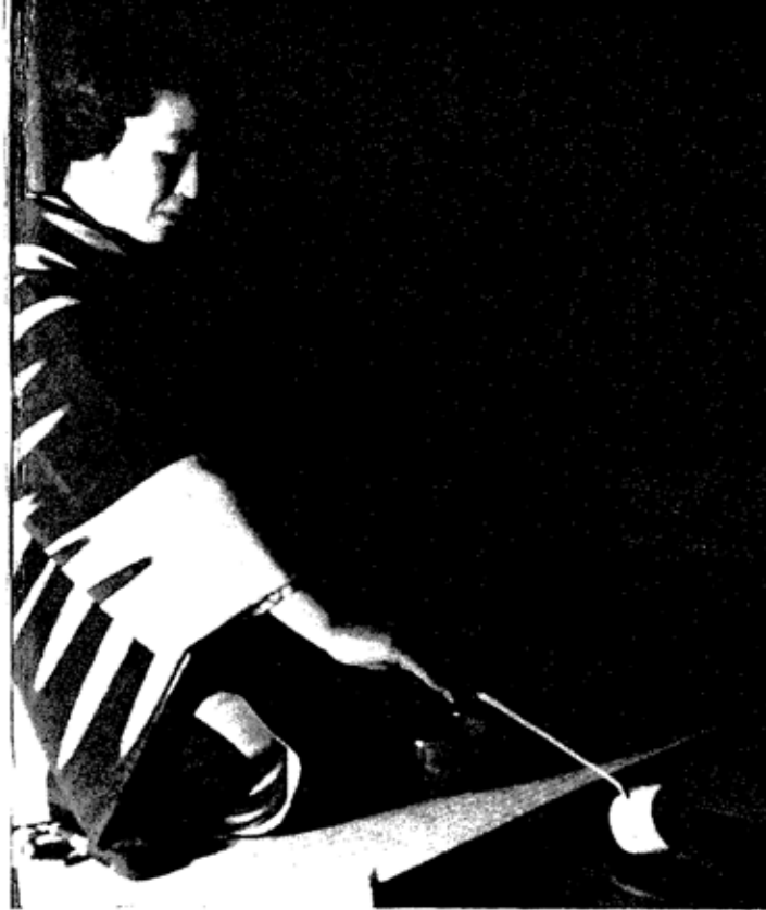
2 Japanese tea ceremony

Below: The Kabuki Choir