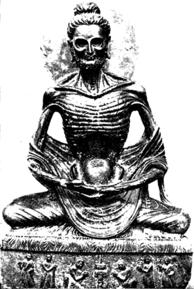
8 Left: The Repentent Buddha, at Gandhara, N.W. India. Lahore Museum, Pakistan