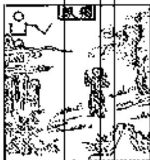
9. The Solitary Moon

The beast all in white now is surrounded by the white clouds, The man is perfectly at his ease and care-free, so is his companion; The white clouds penetrated by the moon-light cast their white shadows below, The white clouds and the bright moon-light-each following its course of movement.