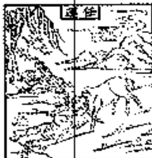
7. Laissez Faire

On the verdant field the beast contentedly lies idling his time away, No whip is needed now, nor any kind of restraint; The boy too sits leisurely under the pine tree, Playing a tune of peace, overflowing with joy.