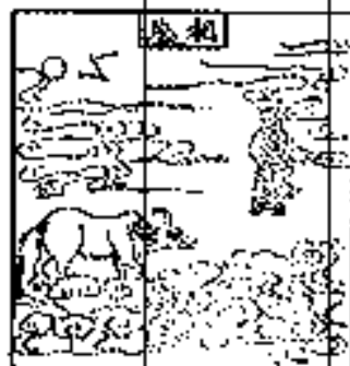
8. All Forgotten

The spring stream in the evening sun flows languidly along the willow-lined bank, In the hazy atmosphere the meadow grass is seen growing thick; When hungry he grazes, when thirsty he quaffs, as time sweetly slides, While the boy on the rock dozes for hours not noticing anything that goes on about him.