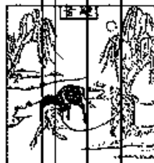
4. Faced Round

The leader holds the rope tightly in his hand never letting it go, All day long he is on the alert almost unconscious of what fatigue is.