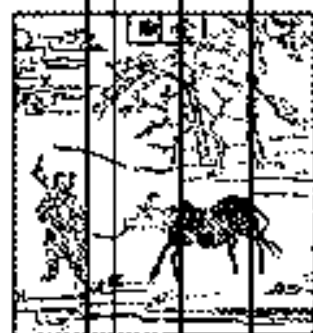
3. In Harness

The beast resists the training with all the power there is in a nature wild and ungoverned, But the rustic oxherd never relaxes his pulling tether and ever-ready whip.