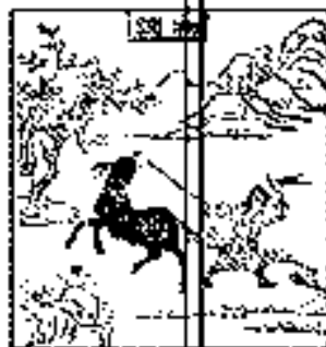
2. Discipline Begun

With his horns fiercely projected in the air the beast snorts, Madly running over the mountain paths, farther and farther he goes astray! A dark cloud is spread across the entrance of the valley, And who knows how much of the fine fresh herb is trampled under his wild hoofs!