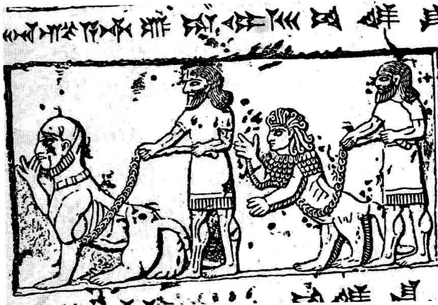
Plate II: The "udumi", the biblical "people of Adam" on the black obelisk (British Museum).