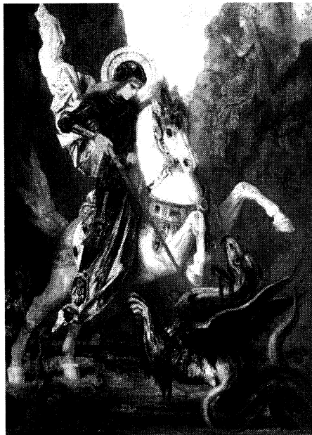
St. George (Sigurd) saving the princess. In both portraits we see the Lady, the Minne (Ostara), who is just beyond reach yet ever present with the hero.