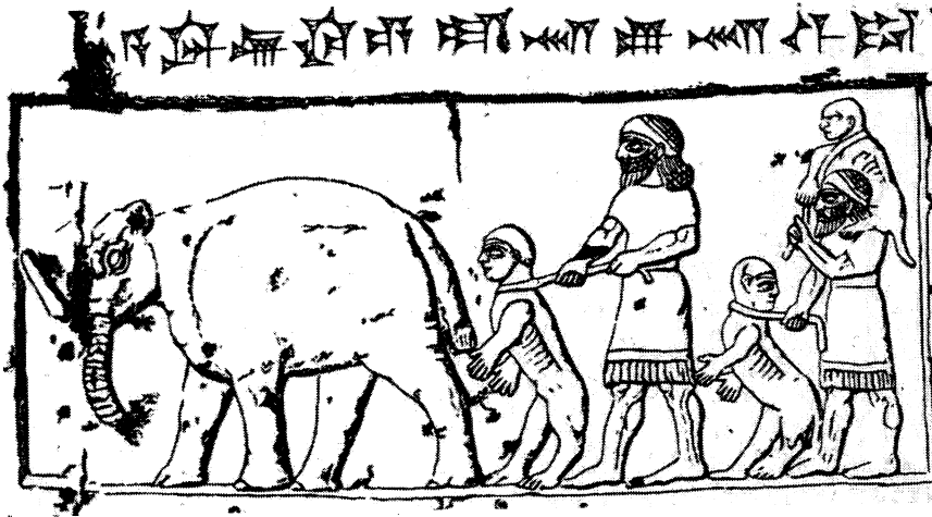
Plate I: Copy of the "baziati" on the black obelisk (British Museum). [If camels and elephants existed, then how can the existence of the other creatures shown in the reliefs be so adamantly denied?]